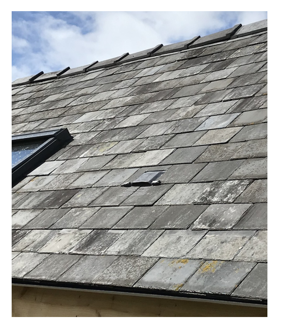
Ref: Bat 3 East facing 'Just Lead bat access slate' with 1F bitumen felt enclosure