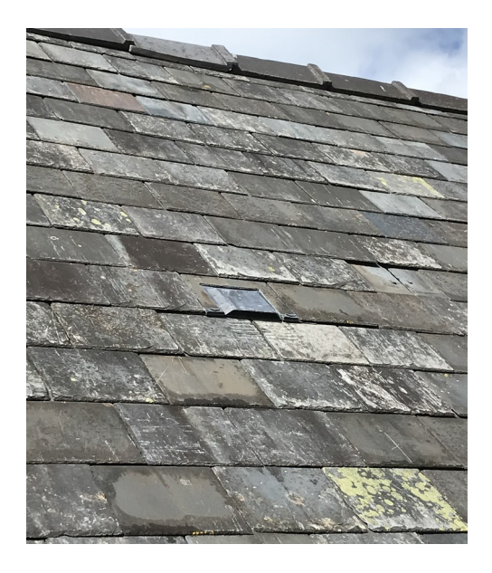
Ref: Bat 2 East facing 'Just Lead bat access slate' with 1F bitumen felt enclosure