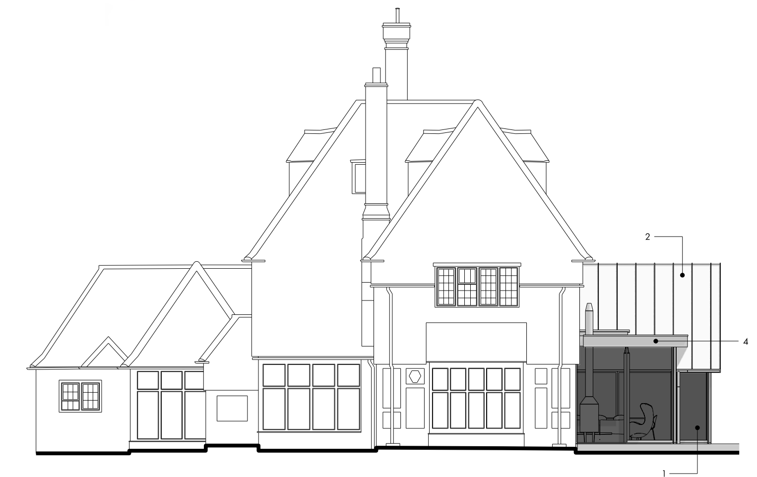
PROPOSED WEST ELEVATION (1:100)