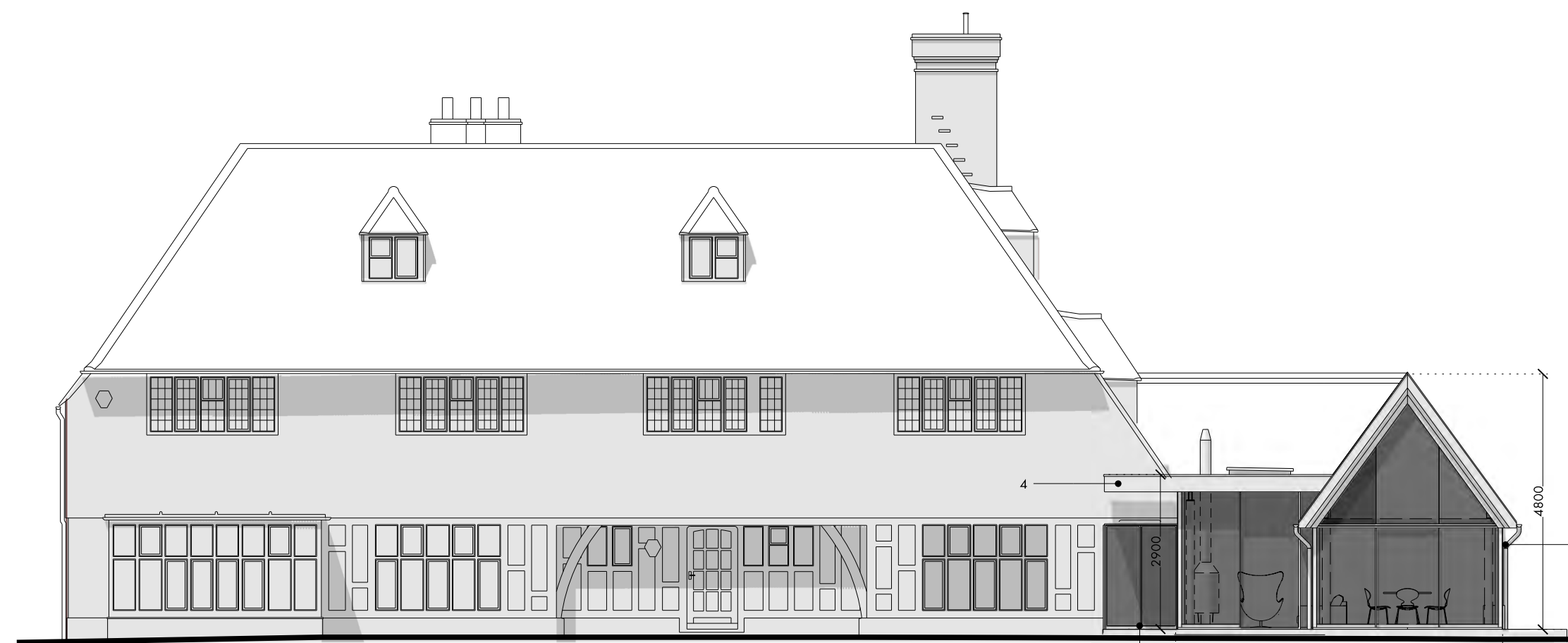
PROPOSED SOUTH ELEVATION (1:100)