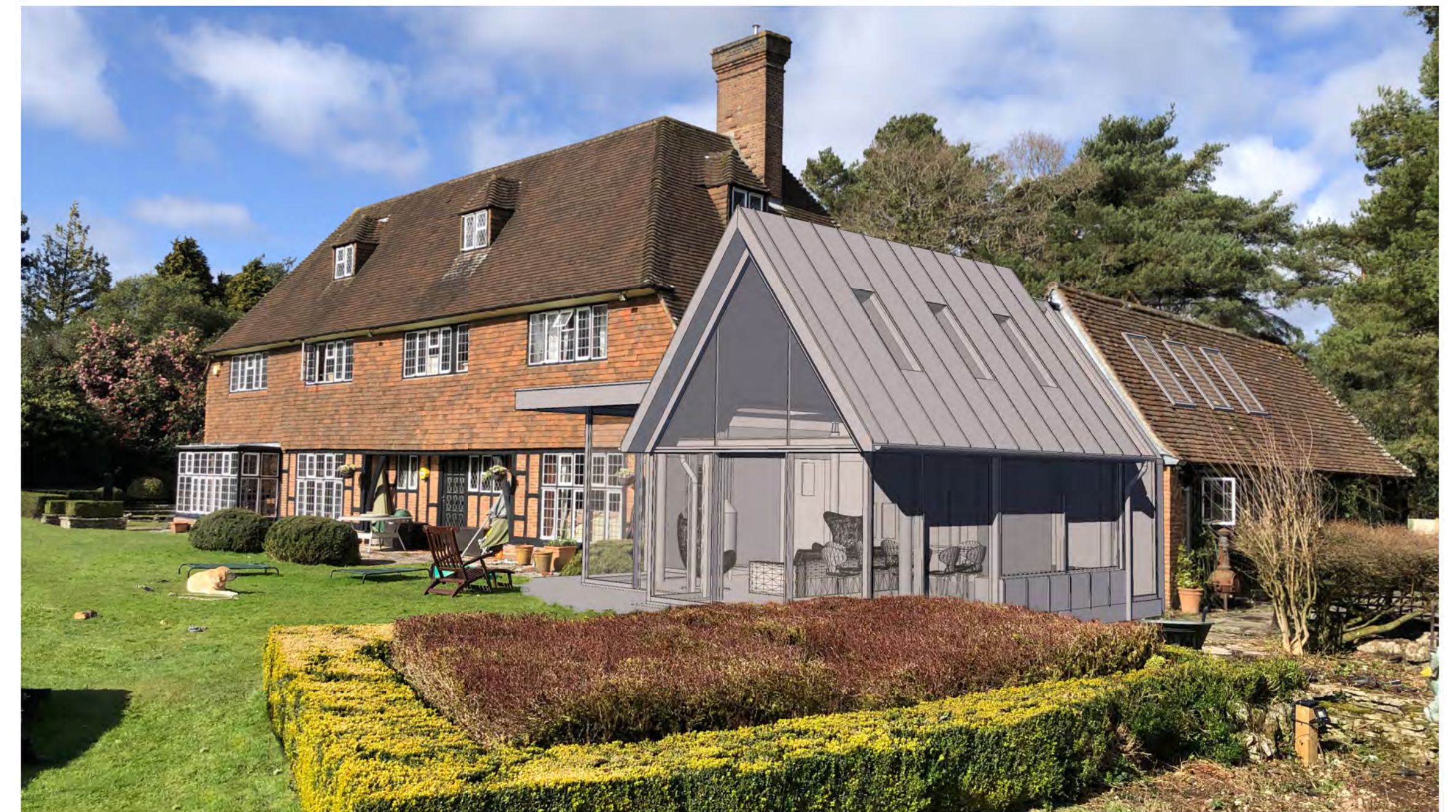
3D SKETCH MOTAGE VIEW

ADDITIONAL GROSS INTERNAL FLOOR AREA - 15.5m.sq.