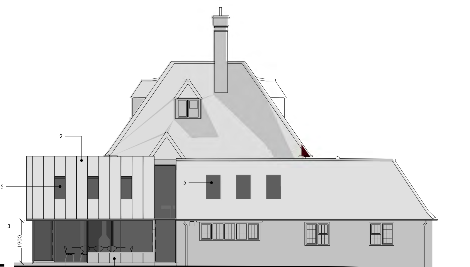
PROPOSED EAST ELEVATION (1:100)