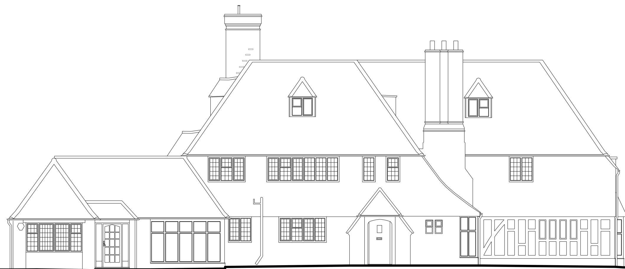
PROPOSED NORTH ELEVATION (1:100)