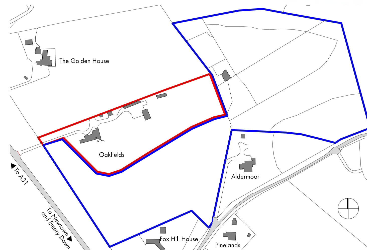
SITE LOCATION PLAN (1:2500)