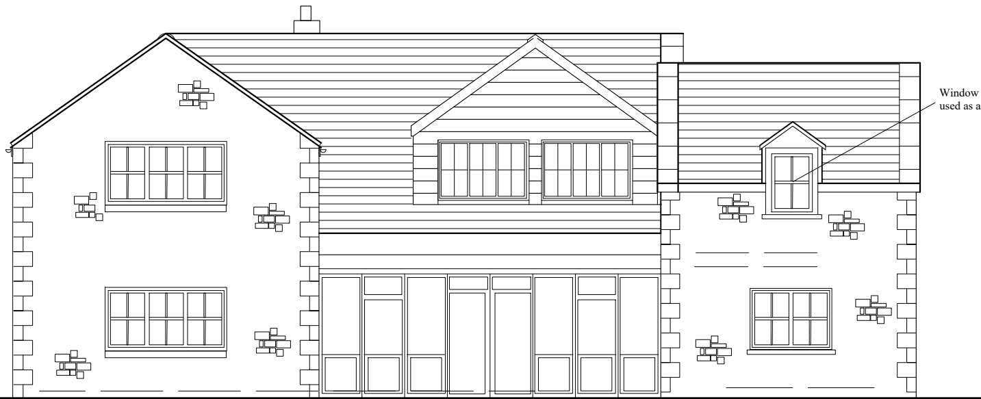
REAR NORTH ELEVATION