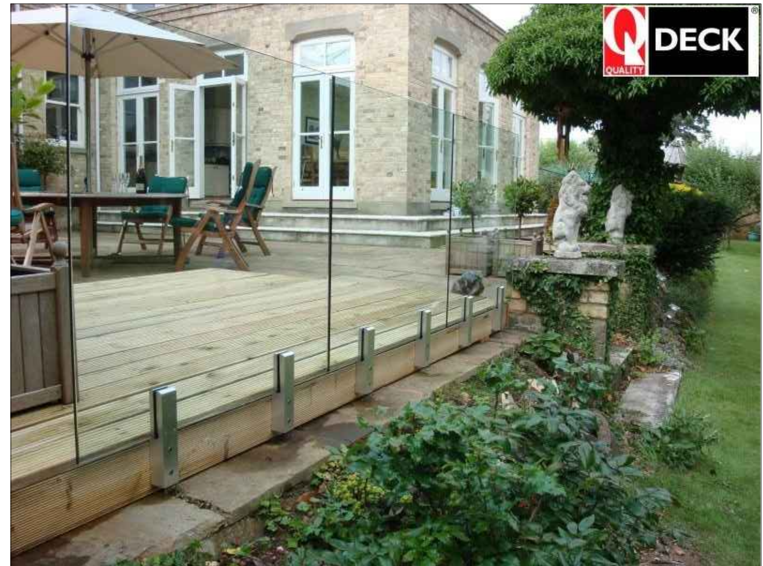
PROPOSED GLAZED BALUSTRADE/DECKING SYSTEM