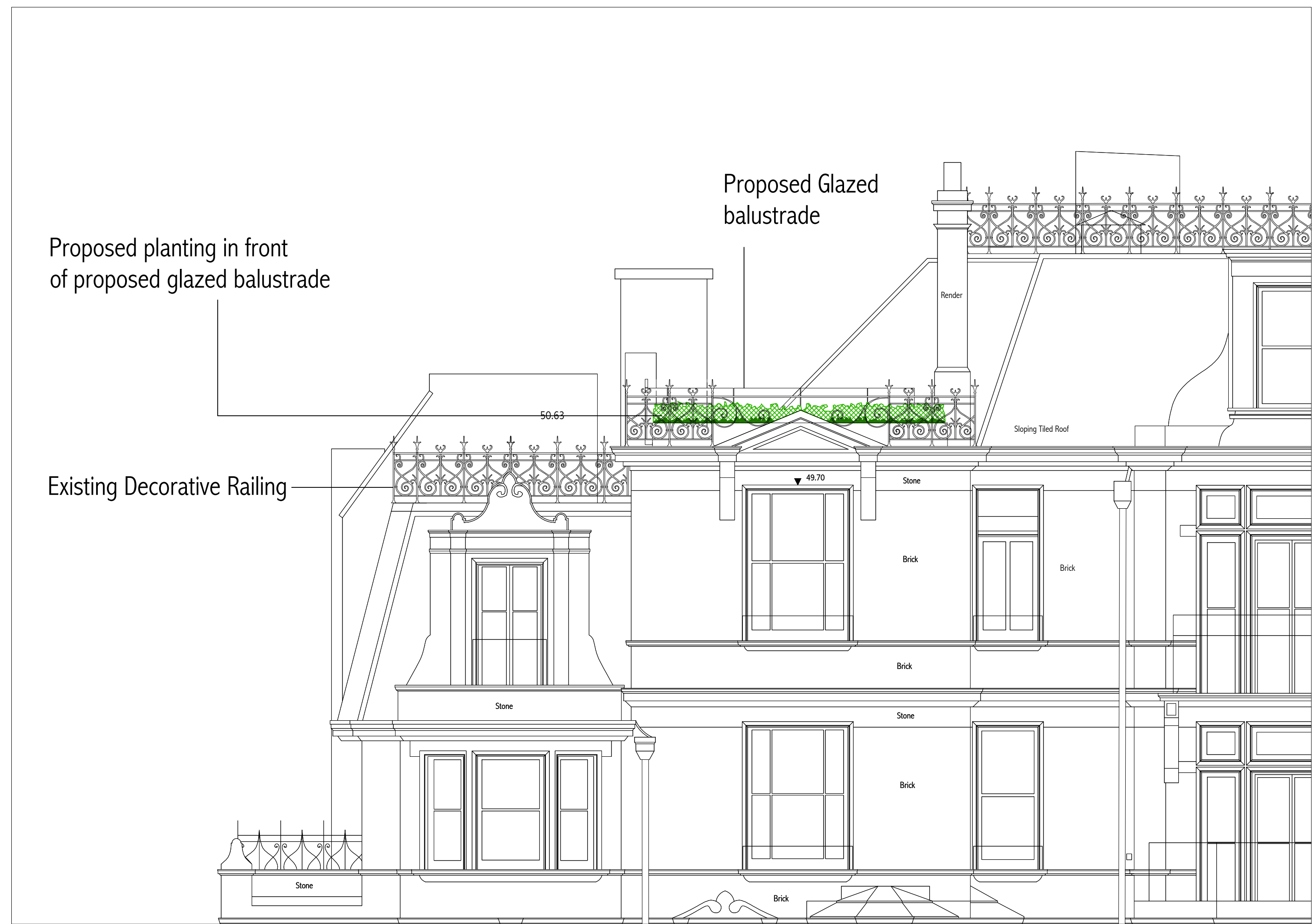
MOSCOW ROAD ELEVATION