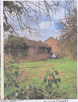
EXISTING DWELLING (TO BE DEMOLISHED)