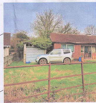
front elevation of garage