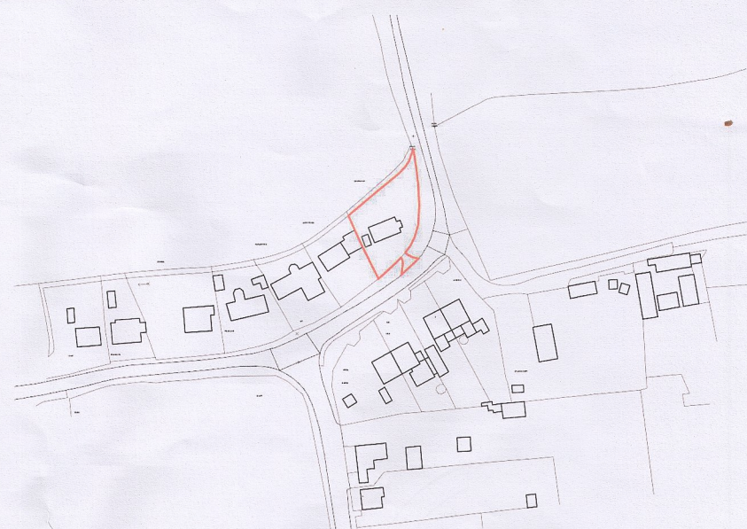
SITE LOCATION PLAN scale 1:1250