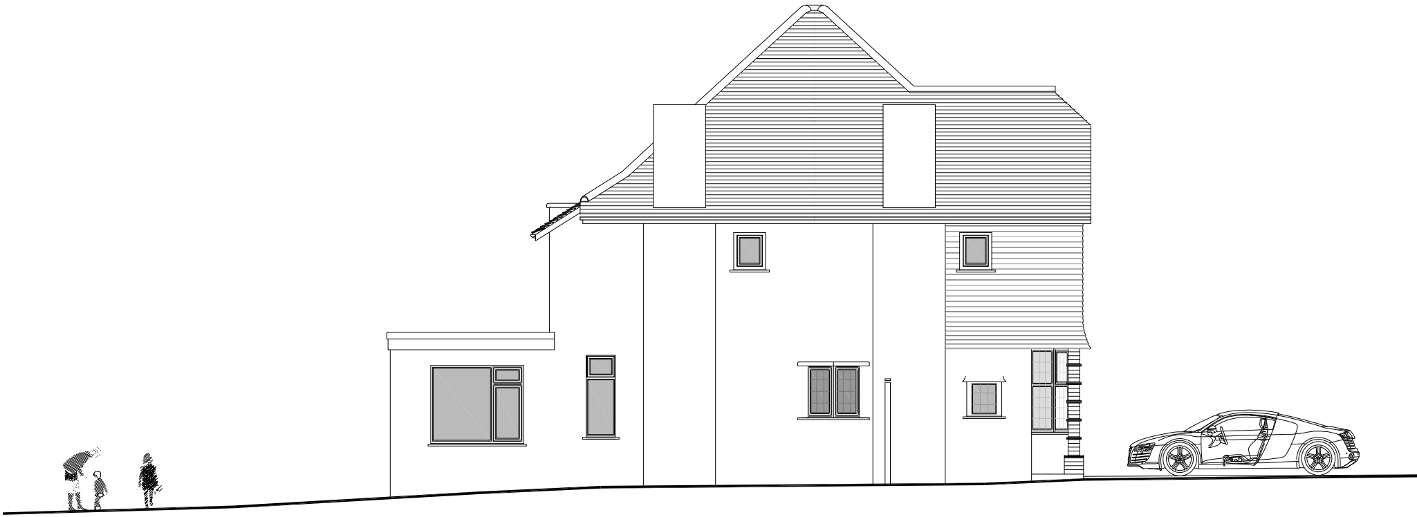
SIDE ELEVATION (South West)

Loft _____ 5.515 First floor _____ 2.760 Ground floor _____ 0.000