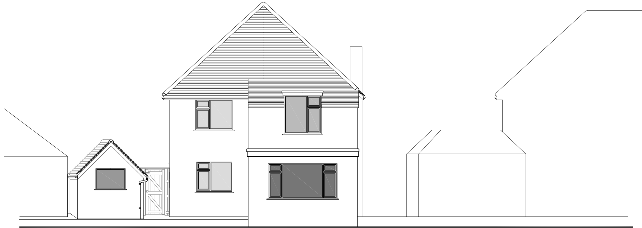
REAR ELEVATION (North West)

Loft _____ 5.515 First floor _____ 2.760 Ground floor _____ 0.000