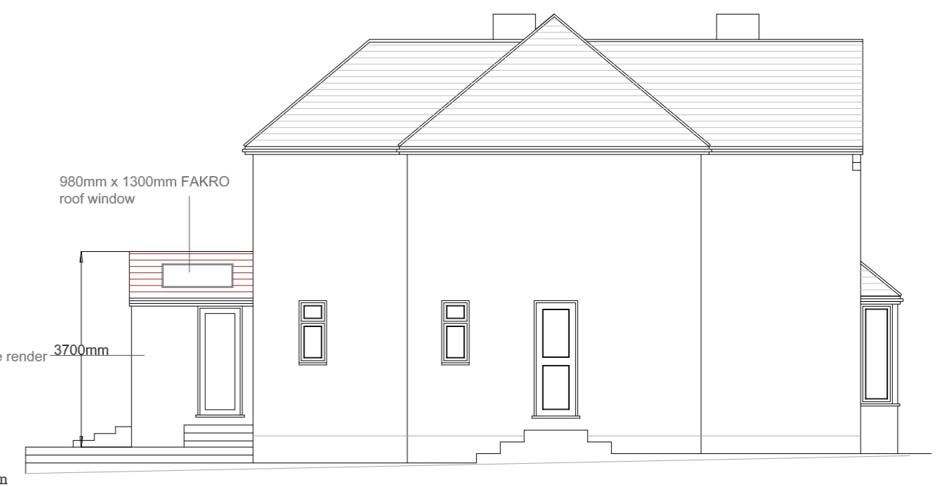
PROPOSED SIDE ELEVATION 1:100