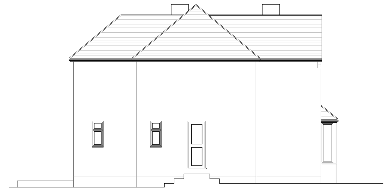
EXISTING SIDE ELEVATION 1:100