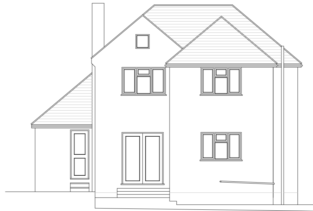
EXISTING SIDE ELEVATION 1:100