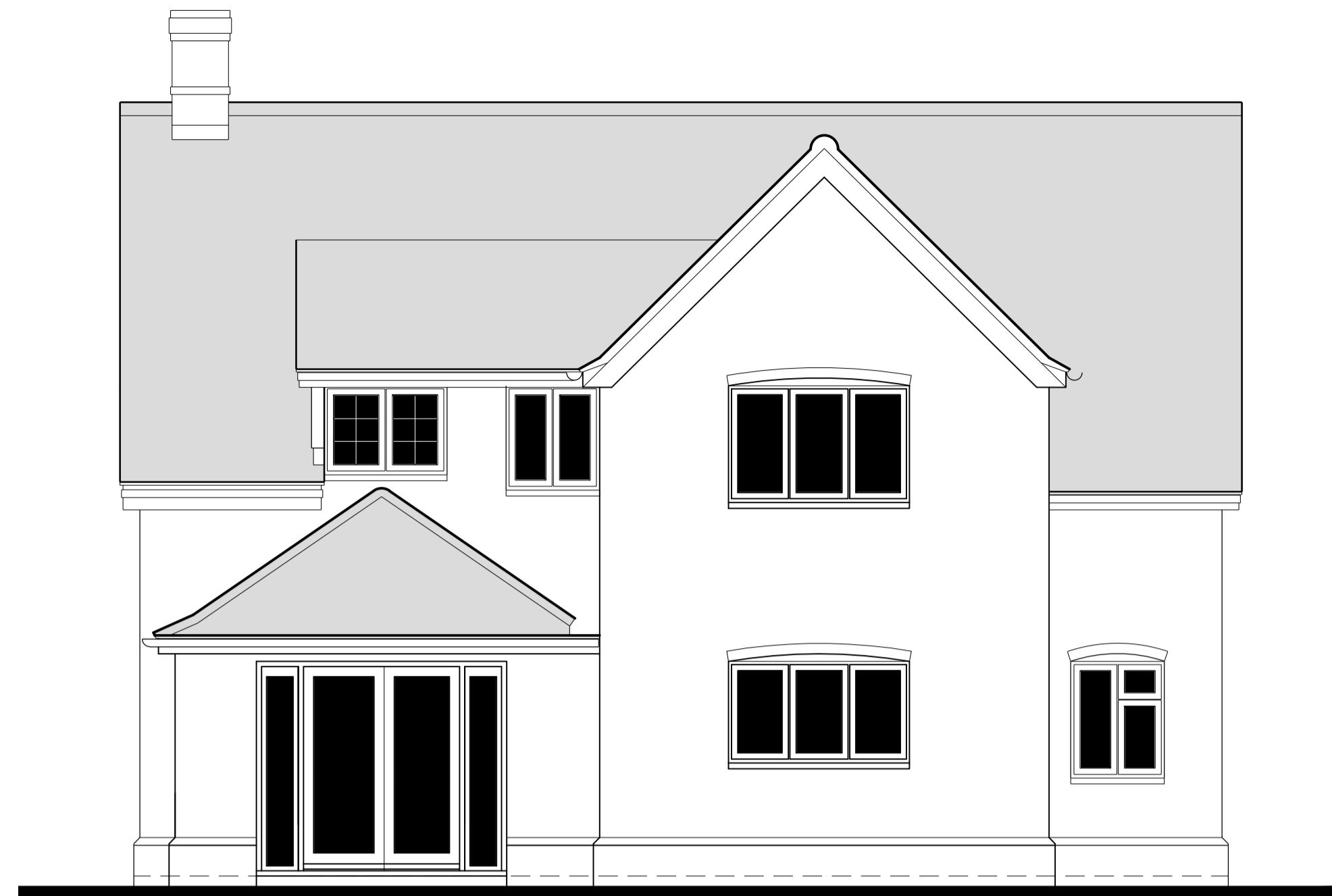
East Elevation - Existing Scale 1:50 @ A1

Notes: Do not scale from this drawing. Where dimensions are shown these are to be verified against site dimensions prior to any setting out, ordering of materials or fabrication. All dimensions in millimetres unless otherwise stated. This document should not be relied on or used in circumstances other than those for which it was originally prepared and for which WOODS DESIGN was commissioned. WOODS DESIGN accepts no responsibility for this document to any other party other than the person by whom it was commissioned. Existing Construction: Walls Facing brickwork in stretcher bond in cement mortar - red Roof Clay pantries - terracotta Doors/windows PVCU & timber - white & coloured Fascias Painted timber - white Rainwater Goods PVCU - black Drainage Surface water to soakaway (assumed) & foul water to mains