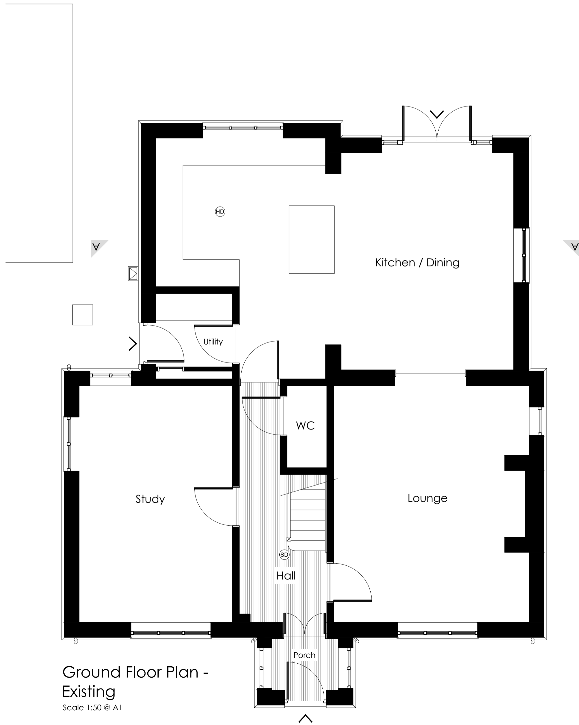
Ground Floor Plan - Existing Scale 1:50 @ A1

Notes: Do not scale from this drawing. Where dimensions are shown these are to be verified against site dimensions prior to any setting out, ordering of materials or fabrication. All dimensions in millimetres unless otherwise stated. This document should not be relied on or used in circumstances other than those for which it was originally prepared and for which WOODS DESIGN was commissioned. WOODS DESIGN accepts no responsibility for this document to any other party other than the person by whom it was commissioned. Existing Construction: Walls Facing brickwork in stretcher bond in cement mortar - red Roof Clay pantries - terracotta Doors/windows PVCU & timber - white & coloured Fascias Painted timber - white Rainwater Goods PVCU - black Drainage Surface water to soakaway (assumed) & foul water to mains