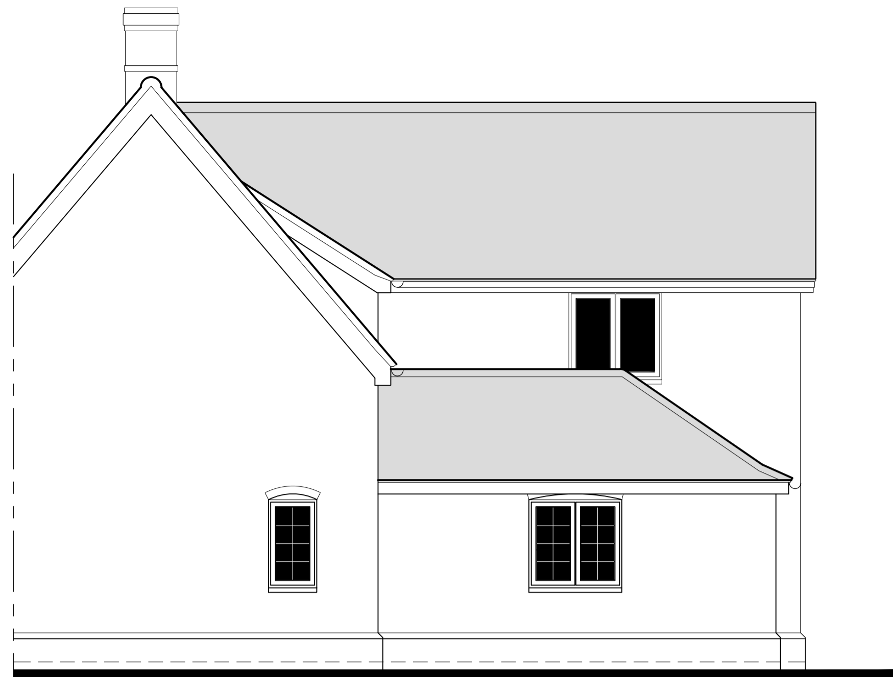
South Elevation - Existing Scale 1:50 @ A1