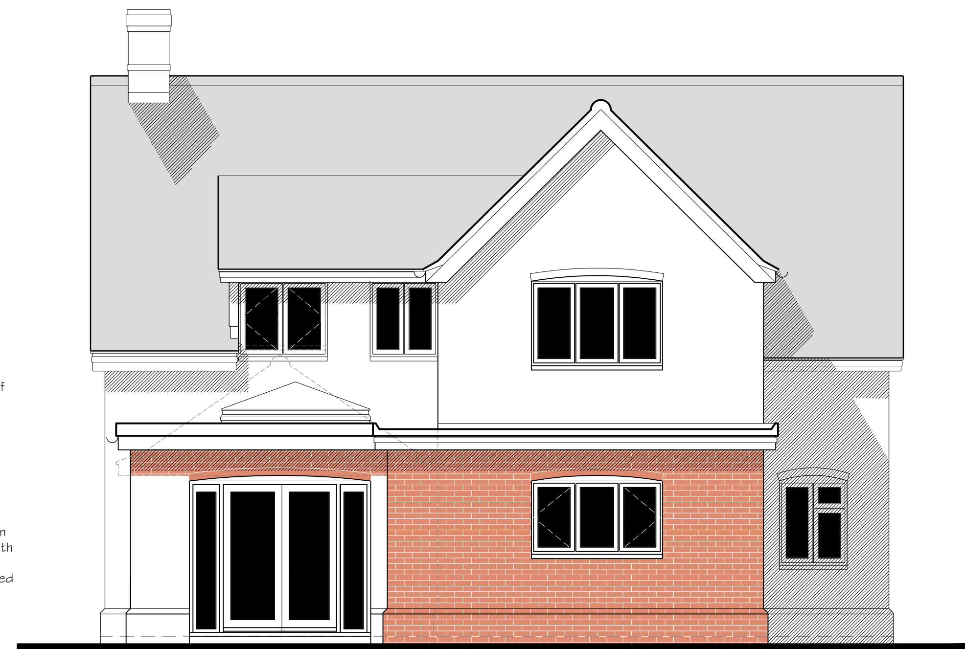
East Elevation - Proposed Scale 1:50 @ A1

Bituminous felt, single ply or fibreglass flat roof covering Rainwater goods PVCU - black Fascias painted timber - white Windows PVCU - white Facing brickwork in stretcher bond with cement mortar to match existing - red