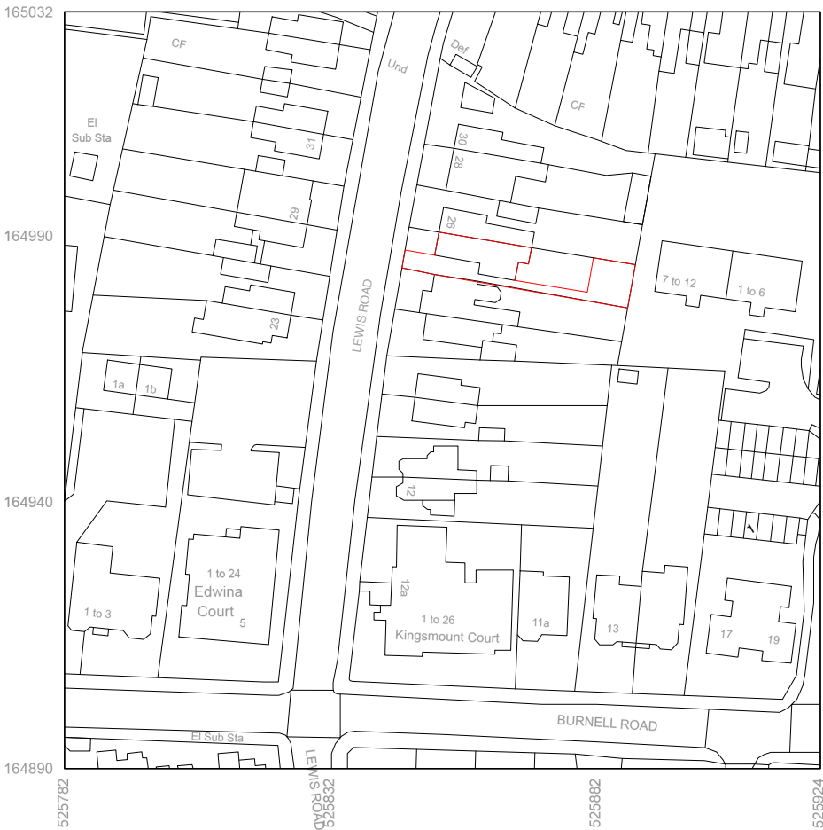
0 Existing location plan 1:1250