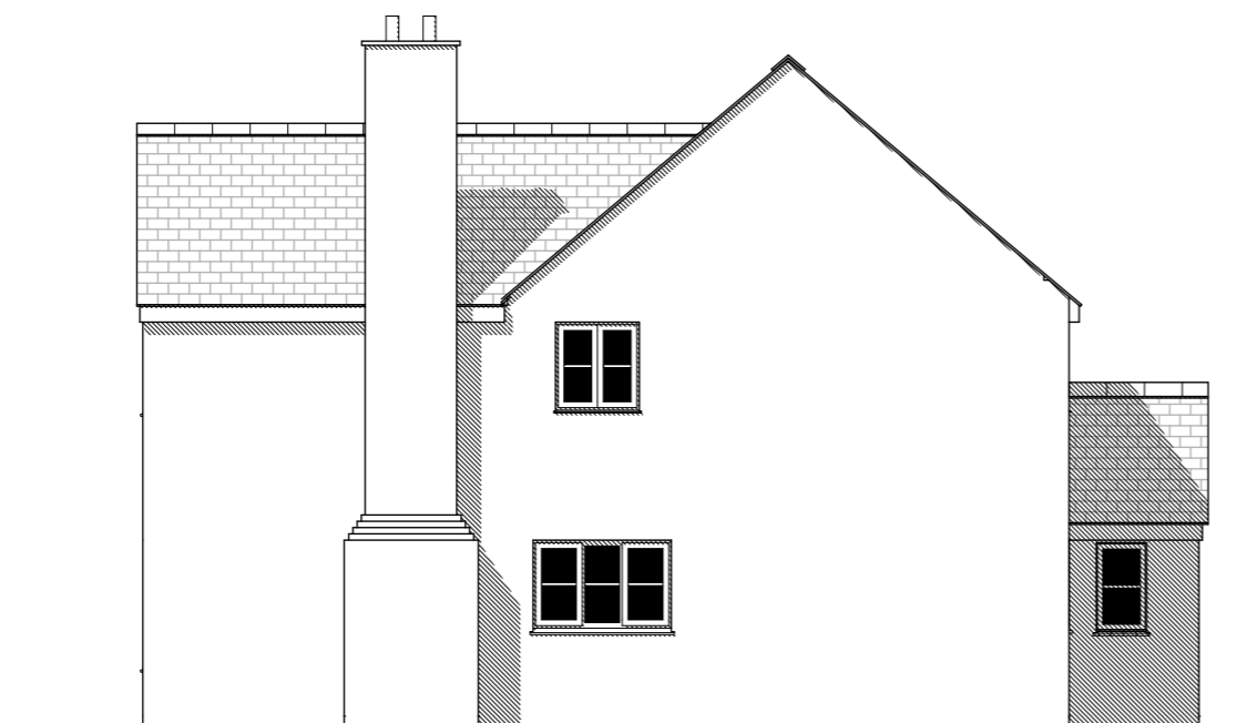
SE (SIDE) ELEVATION 1:100

BOUNDARY TREATMENTS:- ALL EXISTING BOUNDARIES TO REMAIN