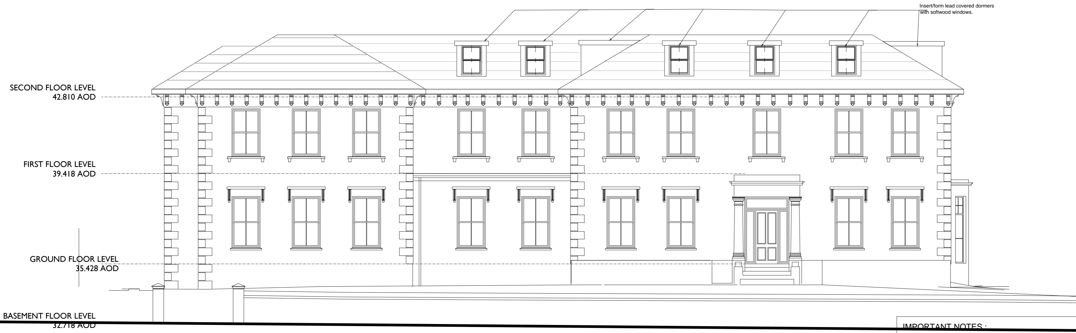
Front (NW) Elevation Proposed