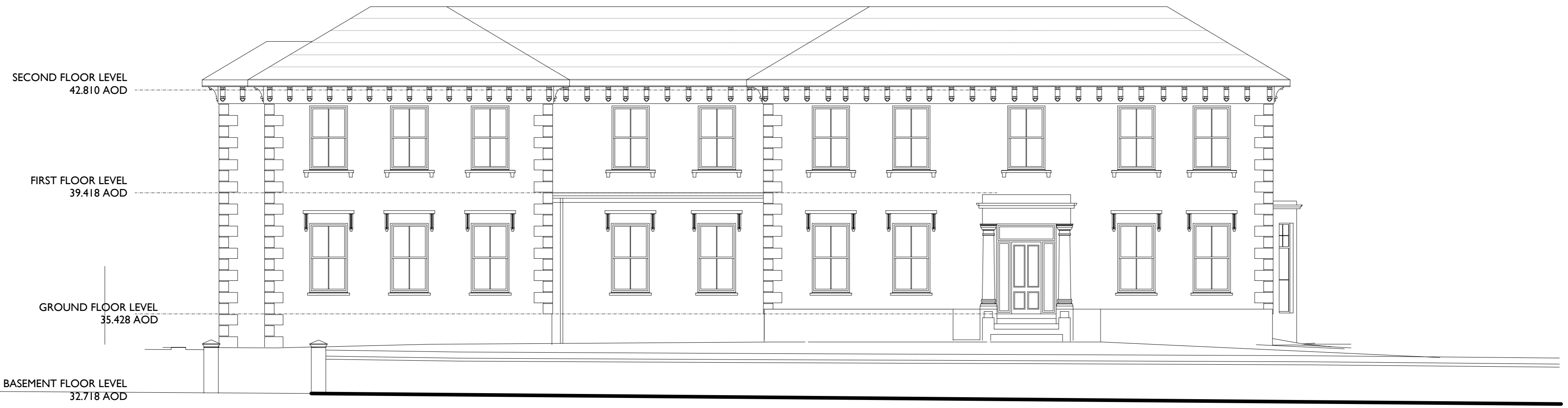
Front (NW) Elevation Existing