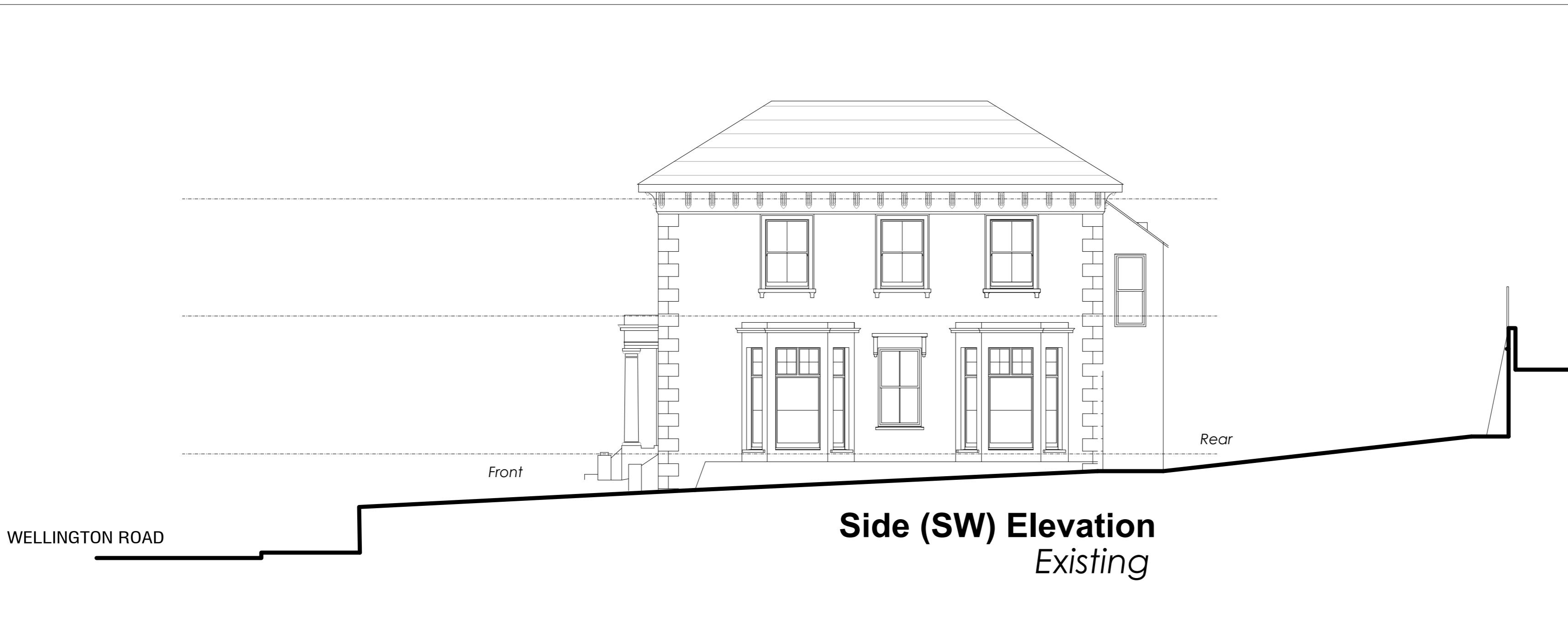
Side (SW) Elevation Existing