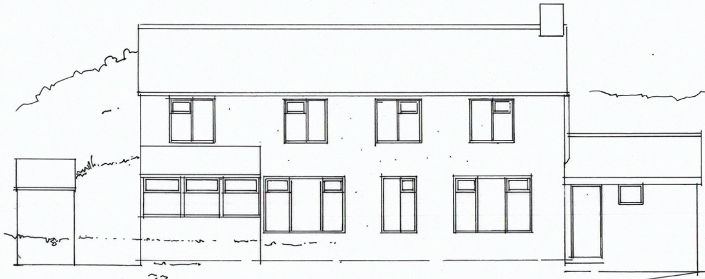
FRONT ELEVATION( SOUTH)