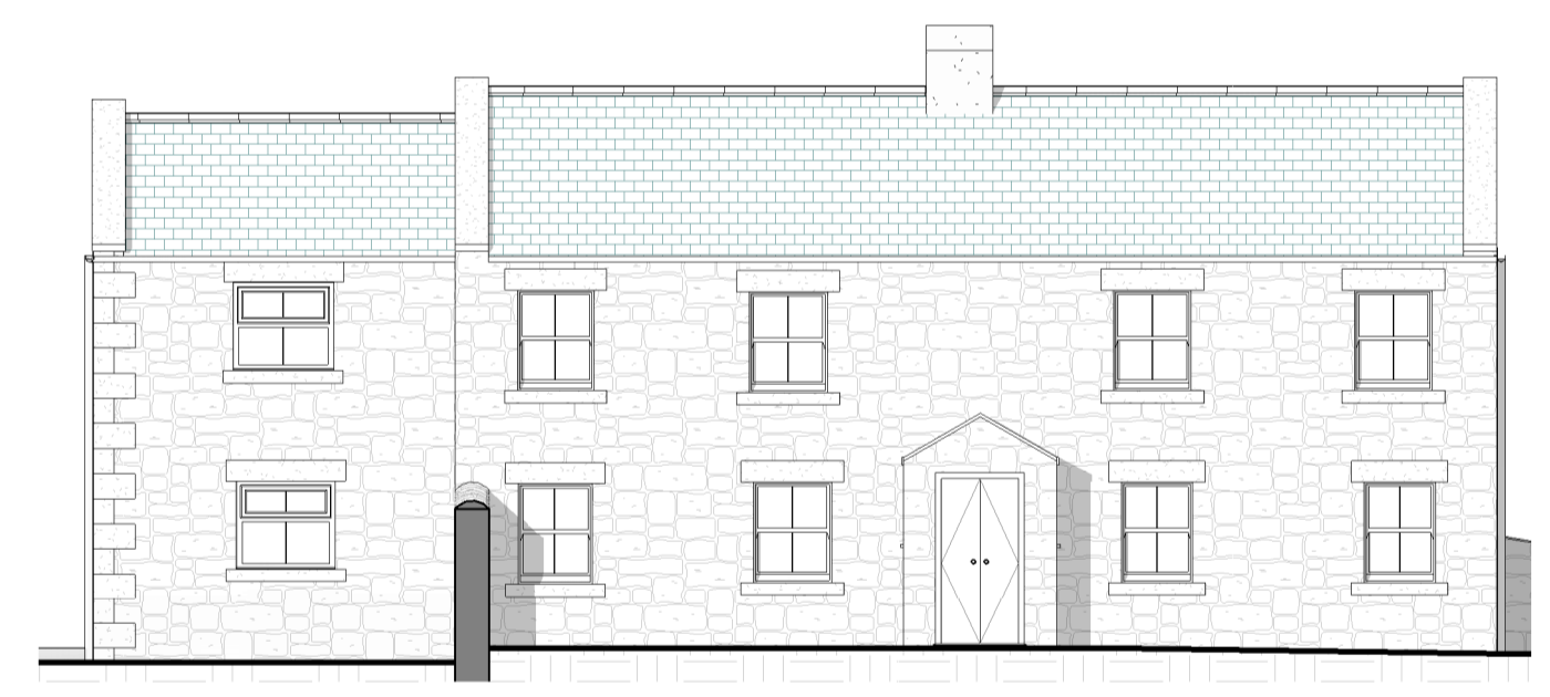
4 Existing Front Elevation 1 : 100