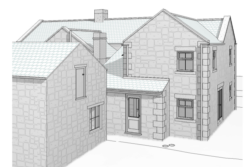
9 Existing 3D 2