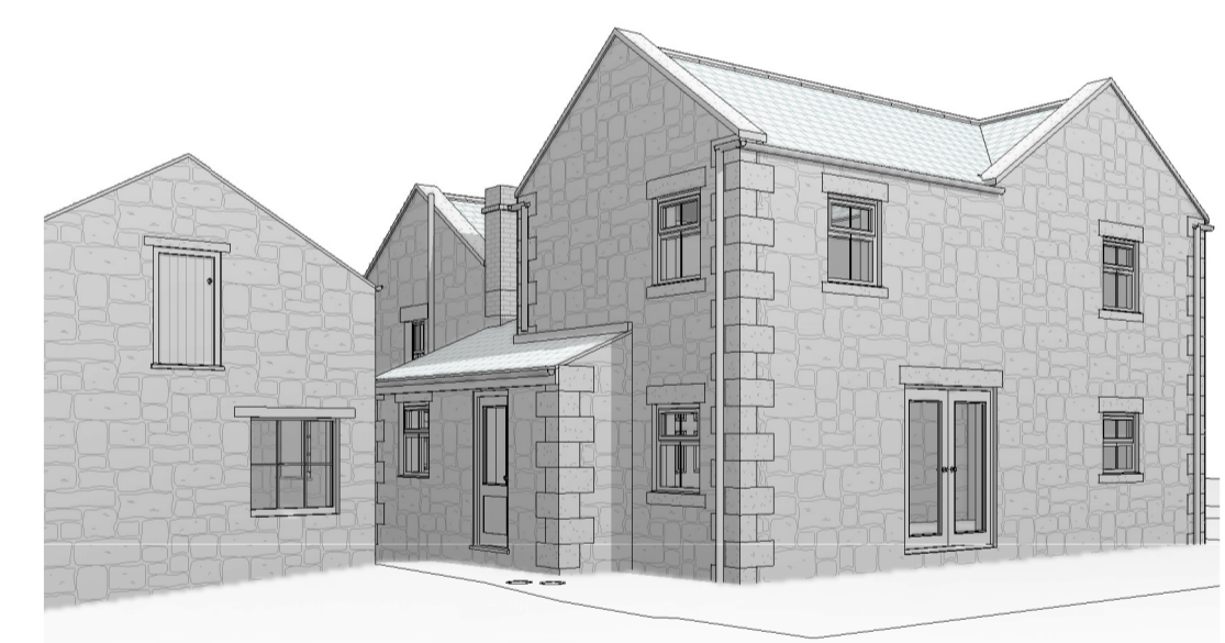
8 Existing 3D 1