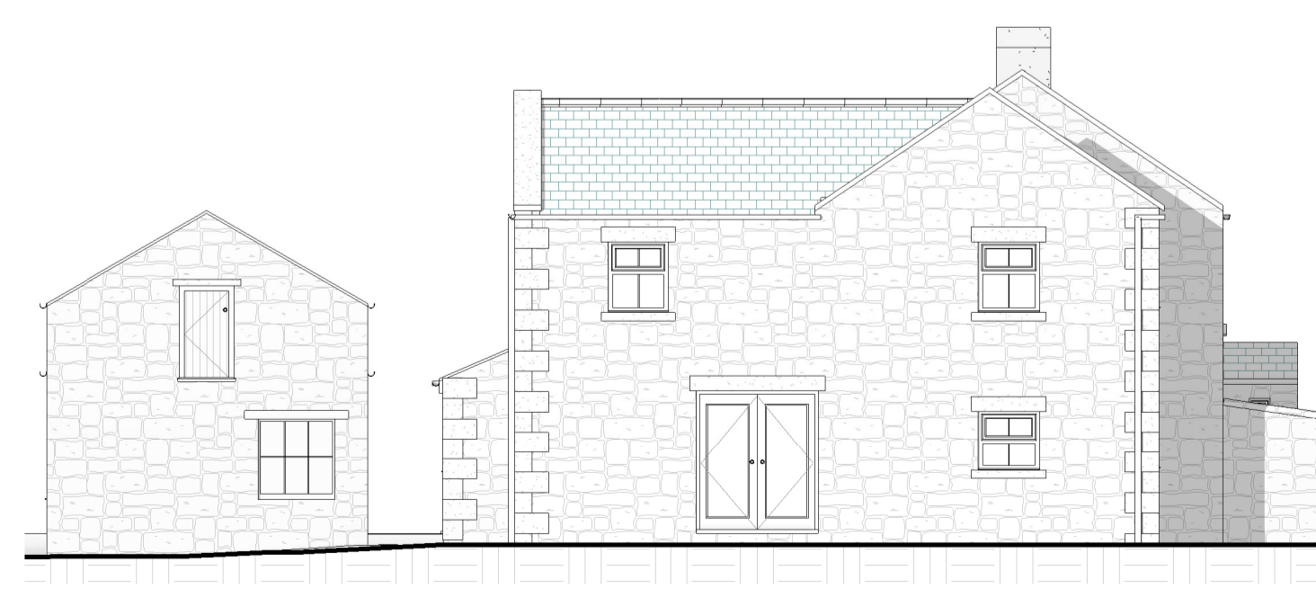
7 Existing West Elevation 1 : 100