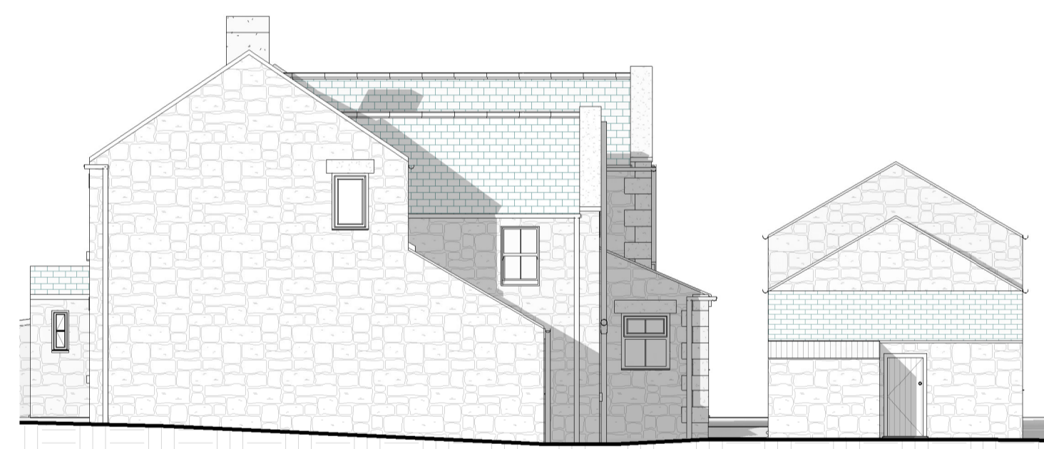
6 Existing East Elevation 1 : 100