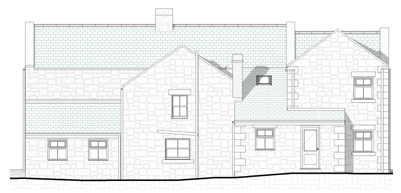
5 Existing Rear Elevation 1 : 100