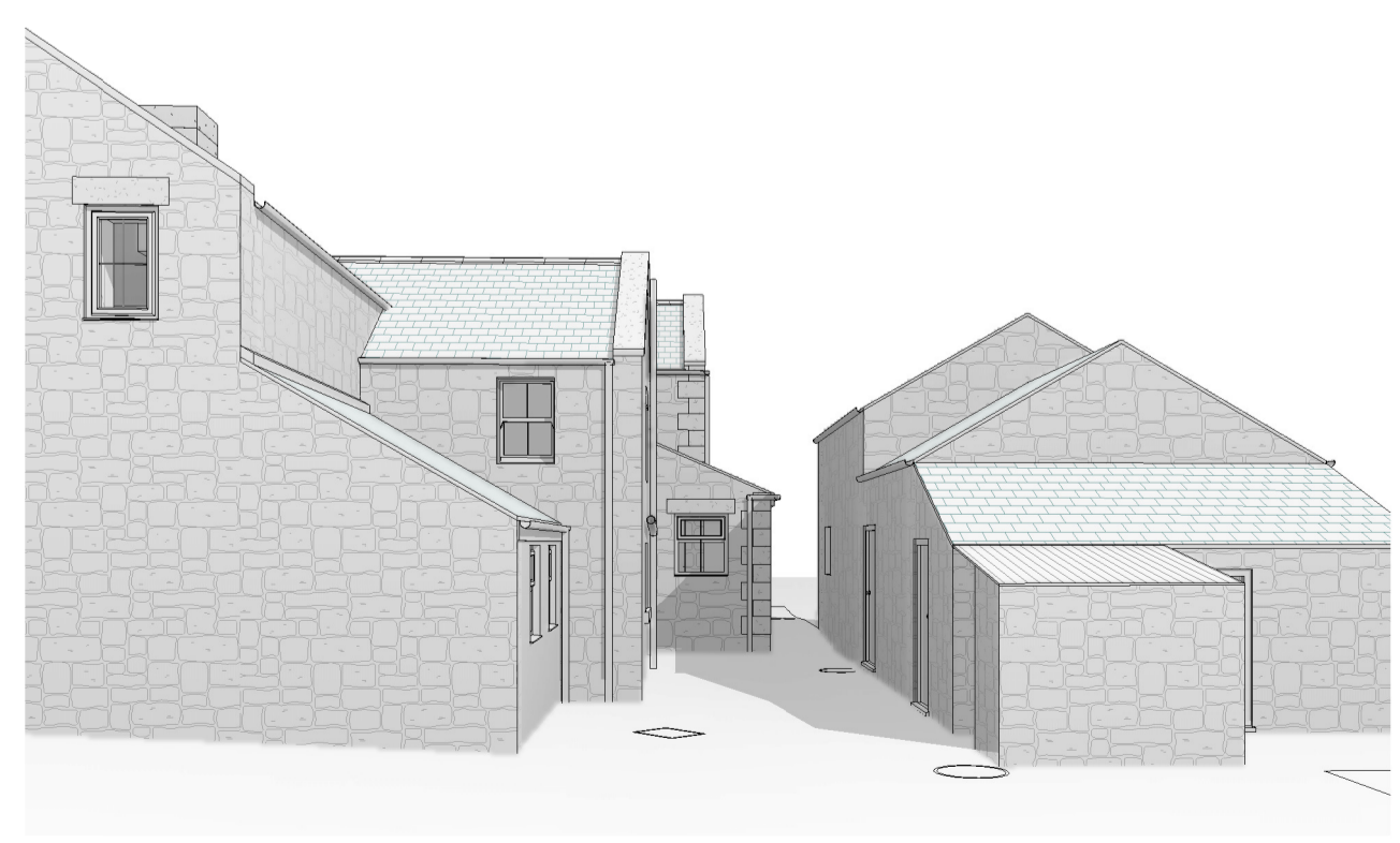
10 Existing 3D 3