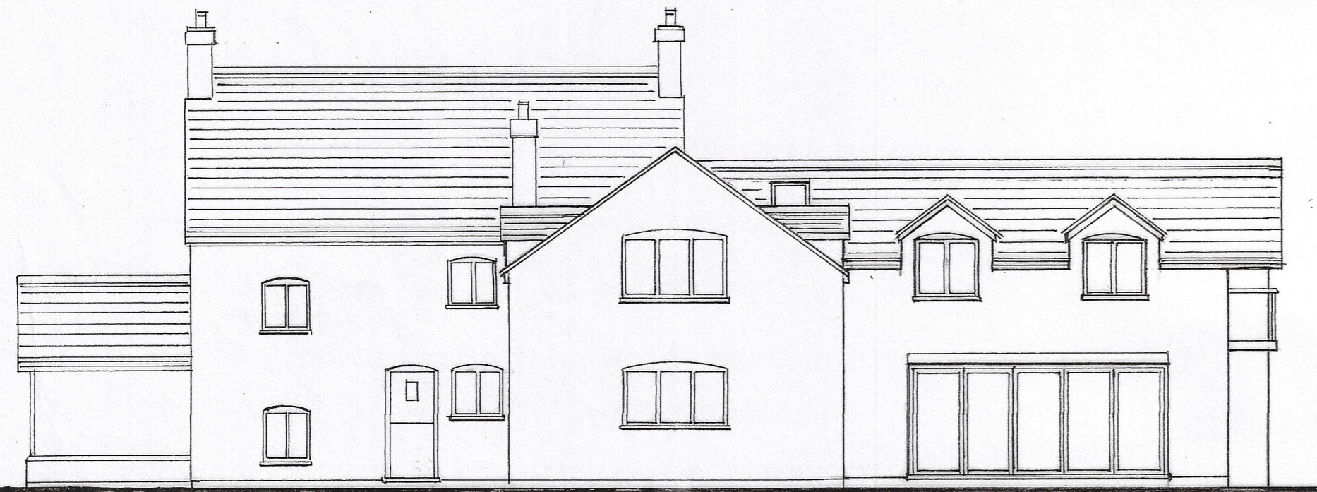
REAR ELEVATION (N.E.)