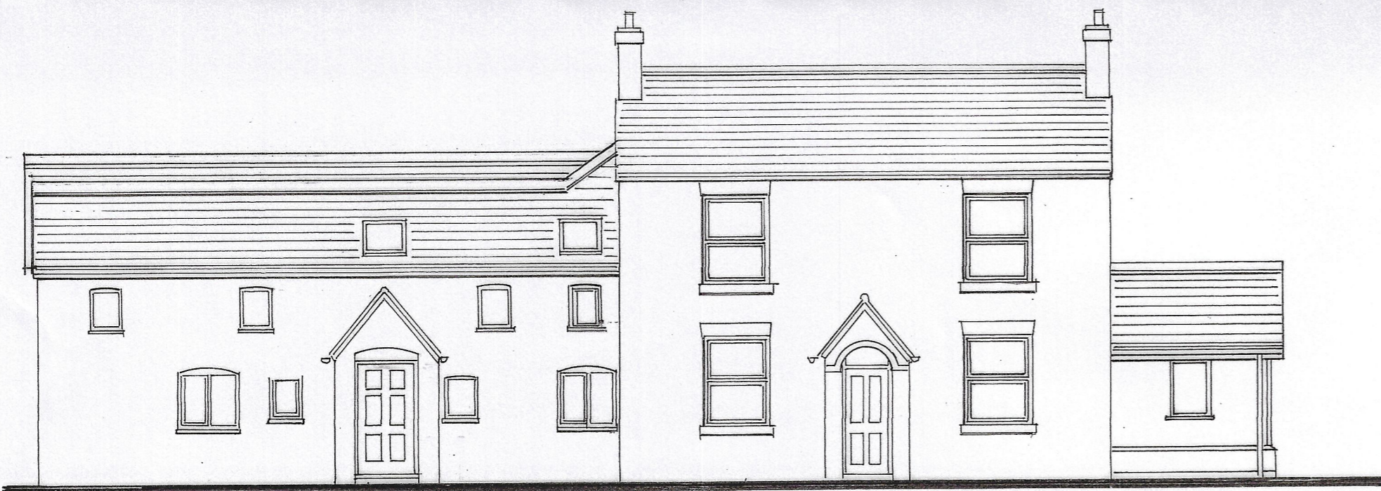
FRONT ELEVATION (S.W.)