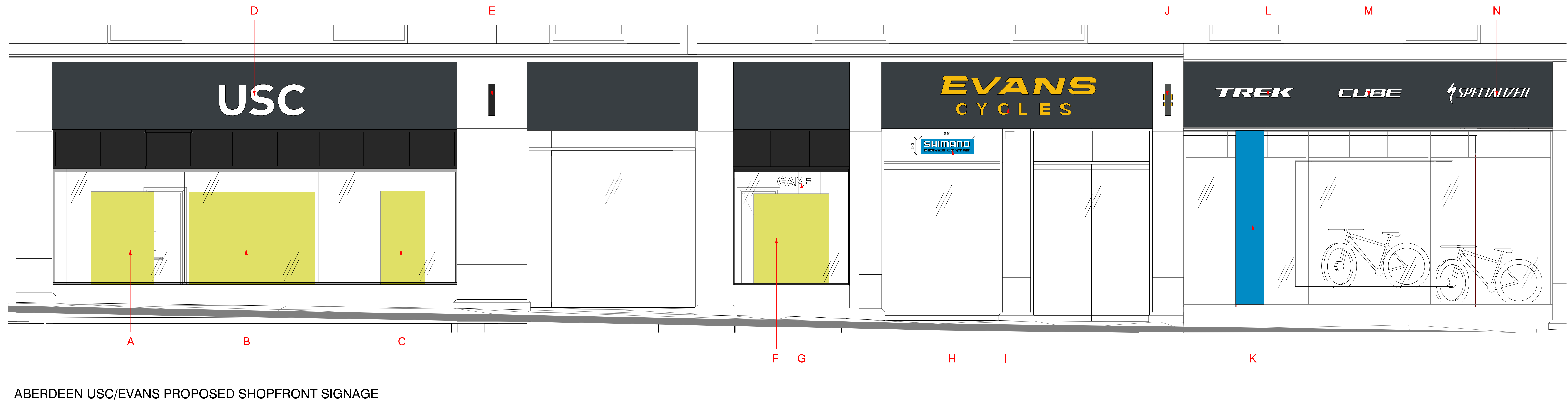
Scale: 1 : 25 @A