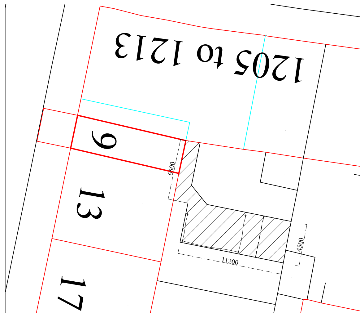
Block Plan as Proposed 1-250 @ A3 5m 10m N

Slabbed pathway from close door to drying and refuse area. Boundary surrounded by black painted metal fencing and timber fence to rear. Each close served with individual drying and refuse area, all kept in good condition. Approx dimensions shown on plan.