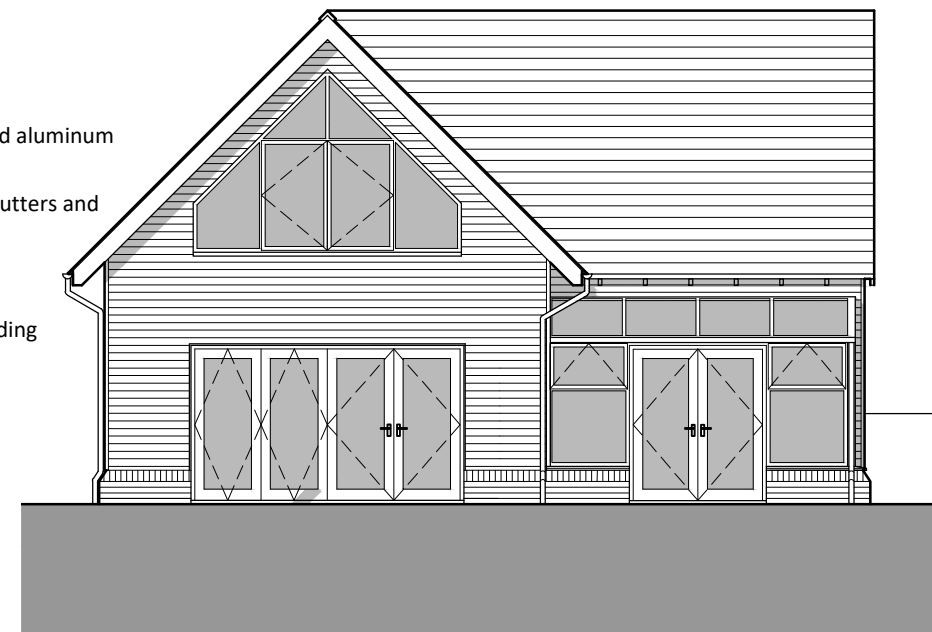
Proposed Garden Elevation (West) 1:100