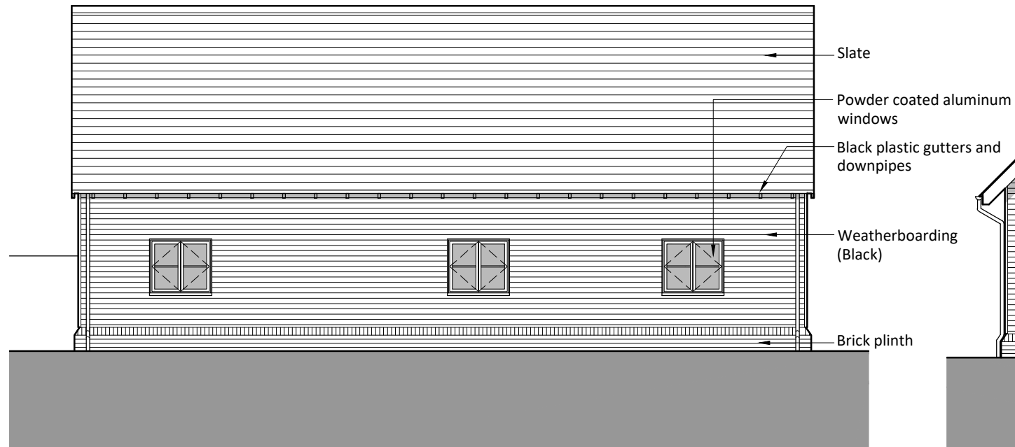
Proposed Rear Elevation (North) 1:100