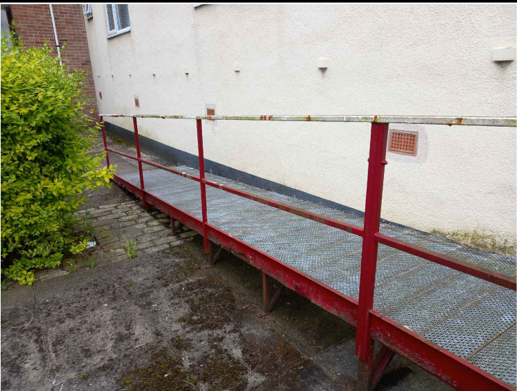
NON COMPLIANT STEEL TEMPORARY RAMP, SEE IMAGE ABOVE.