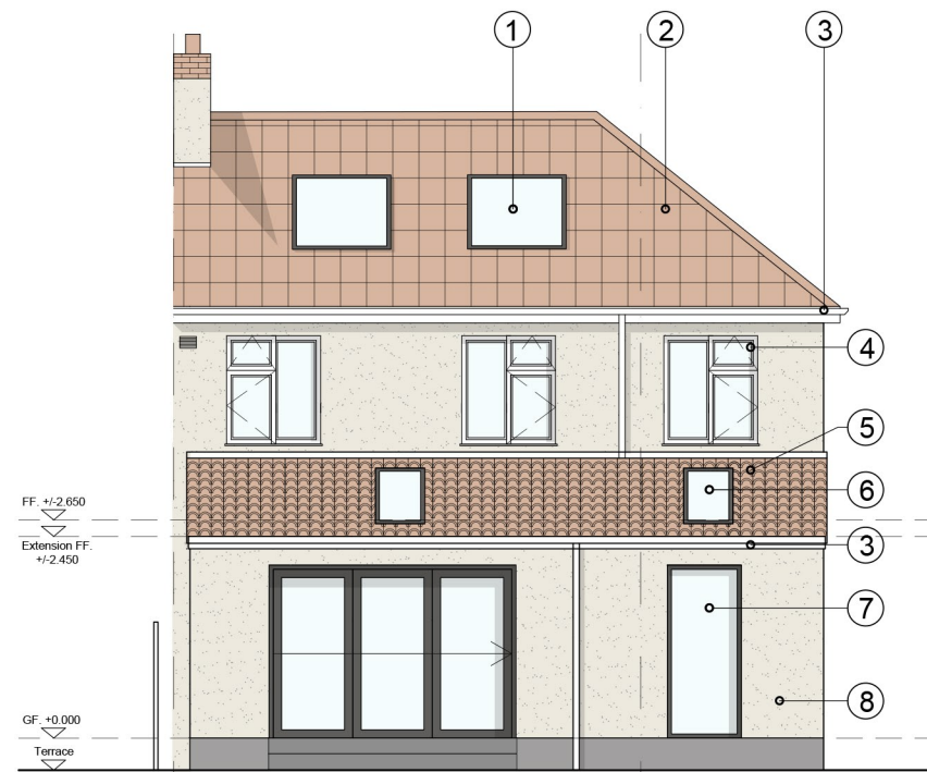
PROPOSED REAR ELEVATION (A)