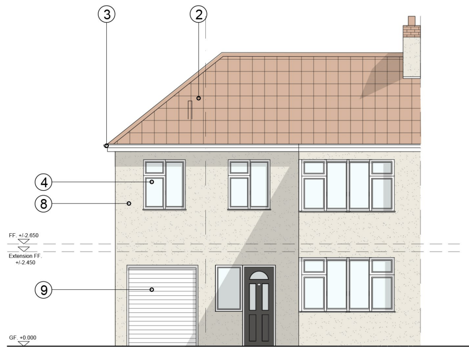
PROPOSED FRONT ELEVATION (C)