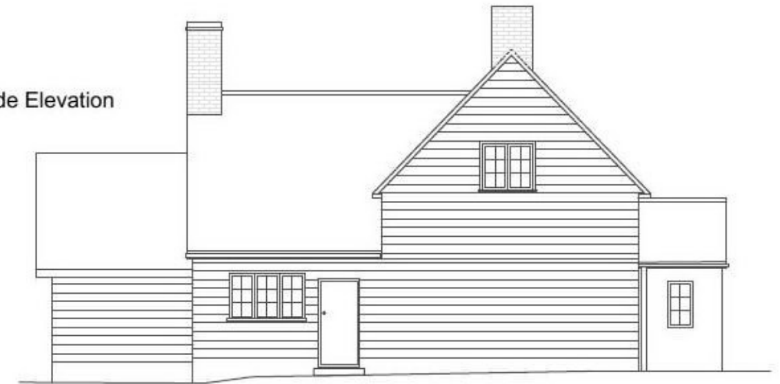
Existing House Side Elevation Scale 1:100