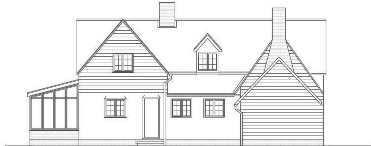
Existing House Rear Elevation Scale 1:100