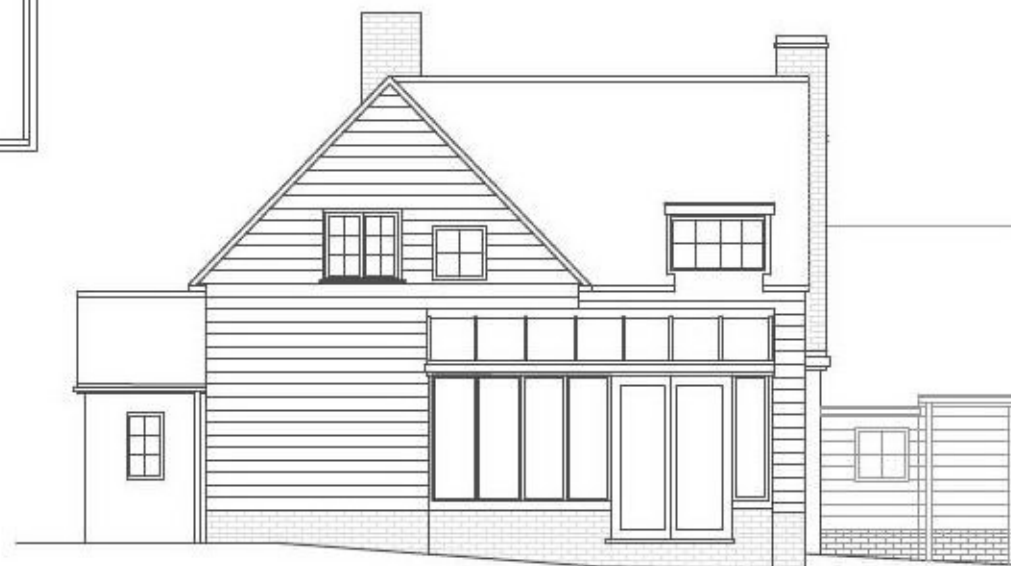
Existing House Side Elevation Scale 1:100