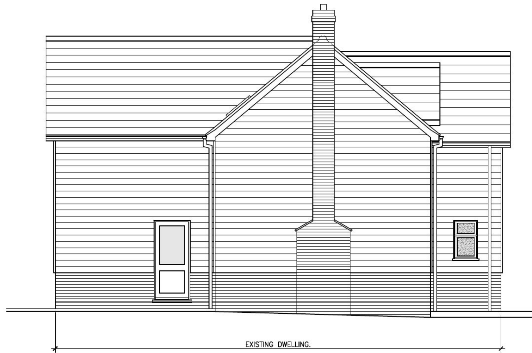
EXISTING DWELLING. EXISTING SIDE ELEVATION SCALE 1:50