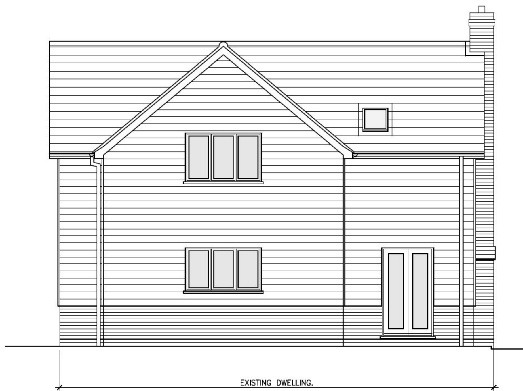
EXISTING DWELLING. EXISTING REAR ELEVATION SCALE 1:50