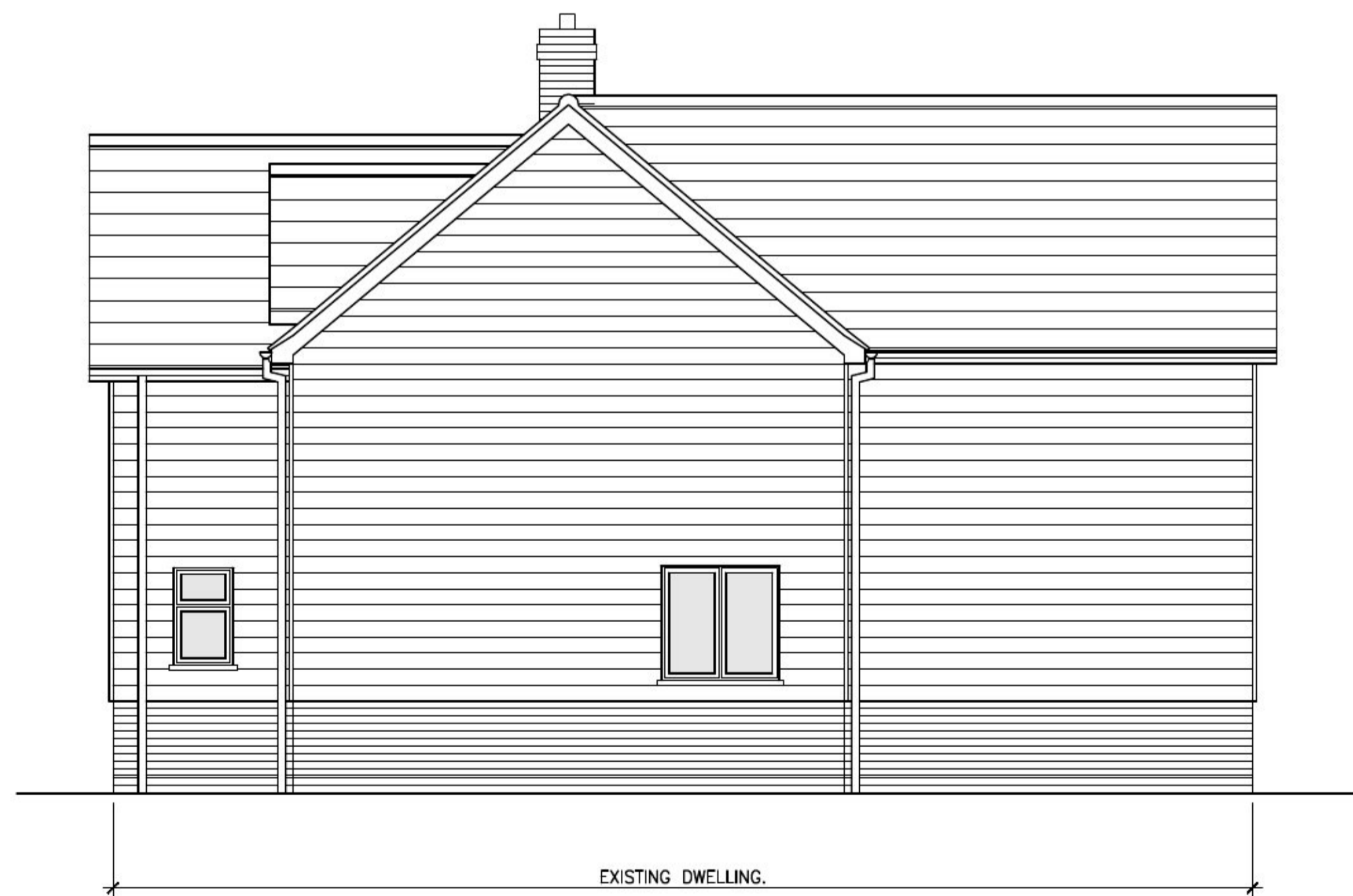
EXISTING DWELLING. EXISTING SIDE ELEVATION SCALE 1:50