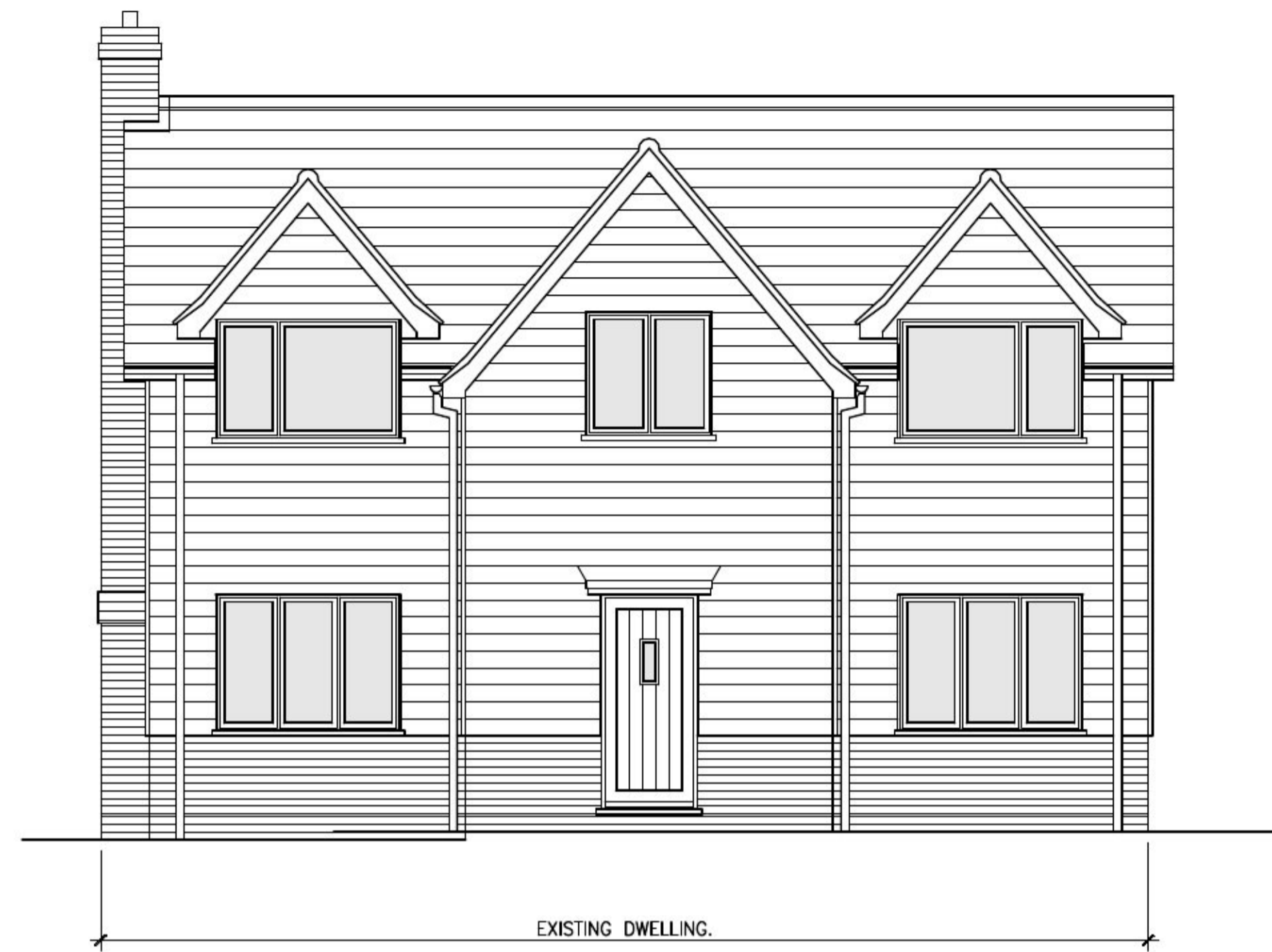
EXISTING DWELLING. EXISTING FRONT ELEVATION SCALE 1:50