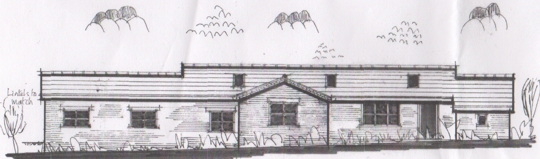
PROPOSED REAR VIEW - north