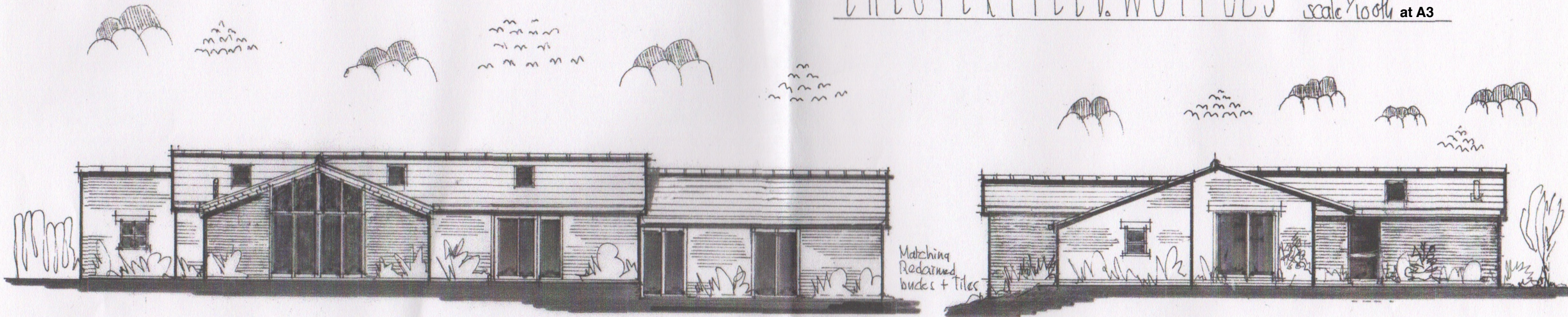
PROPOSED FRONT VIEW - south

CHESTERFIELD. WS 14 0EJ scale 1/100th at A3