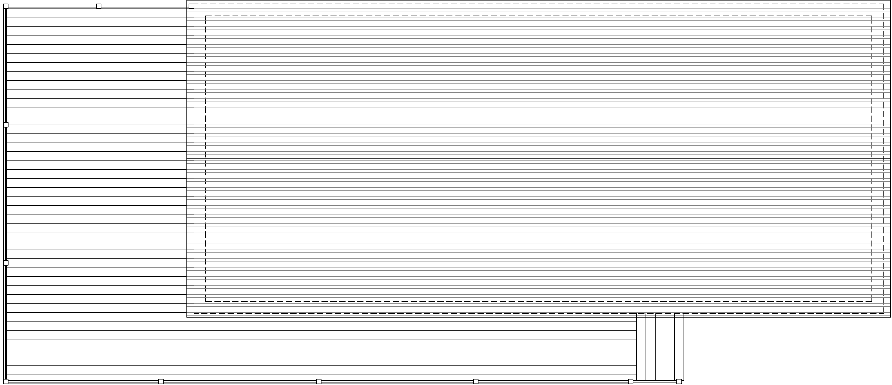
UNIT 1 - PROPOSED ROOF PLAN

GENERAL DO NOT SCALE FROM THIS DRAWING. CHECK ACCURACY OF DIMENSIONS ON SITE. DISCREPANCIES BETWEEN SCALE. DIMENSIONS, DRAWINGS OR SPECIFICATION ARE SUBJECT TO VARIIFICATION BEFORE PURCHASING, MANUFACTURE OR WORK PROCEEDS. CONTRACTOR TO BE RESPONSIBLE FOR ANY DISCREPANCIES AFTER DRAWING APPROVED. © THIS DRAWING, DESIGN AND THE ILLUSTRATED WORKS ARE COPYRIGHT OF BOUGHTON BUTLER LIMITED AND MAY NOT BE REPRODUCED BY A THIRD PARTY WITHOUT WRITTEN CONSENT.