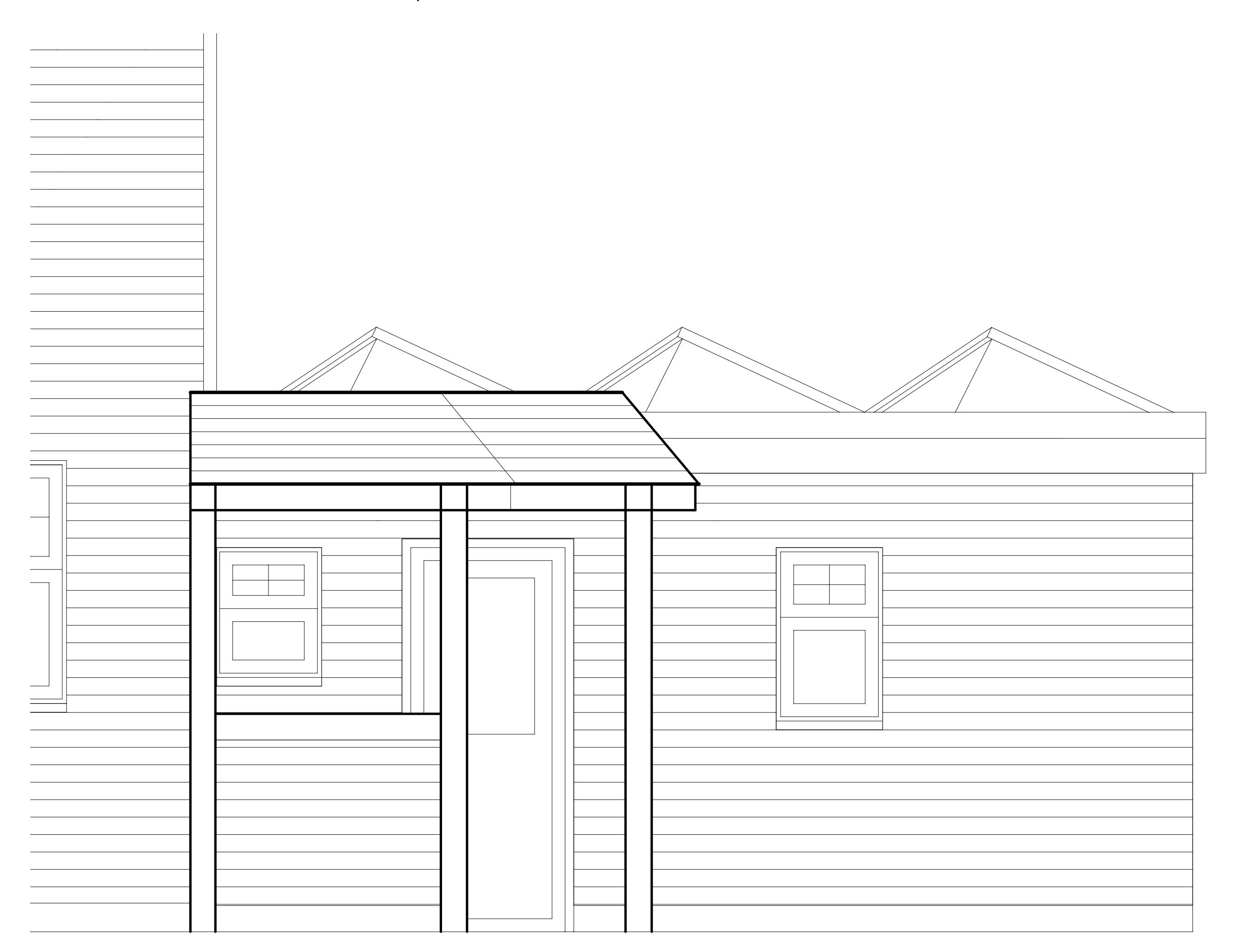
Proposed Porch - Front Elevation - Scale 1:20