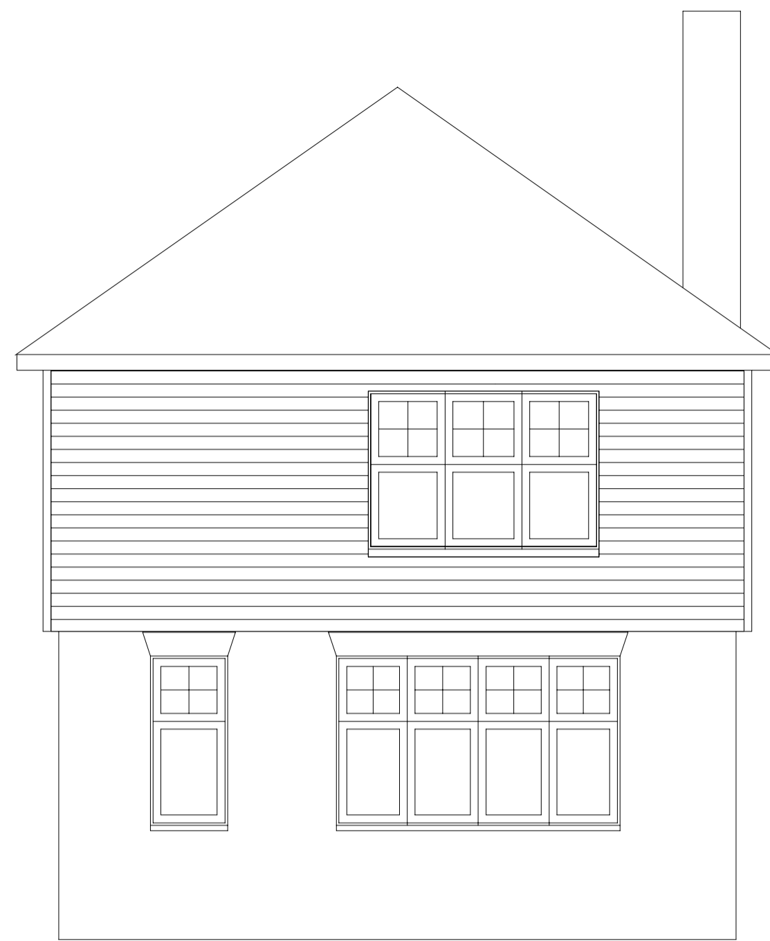
Proposed Side Elevation - Scale 1:50