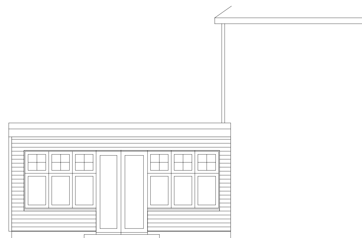
Proposed Internal Side Elevation - Scale 1:50