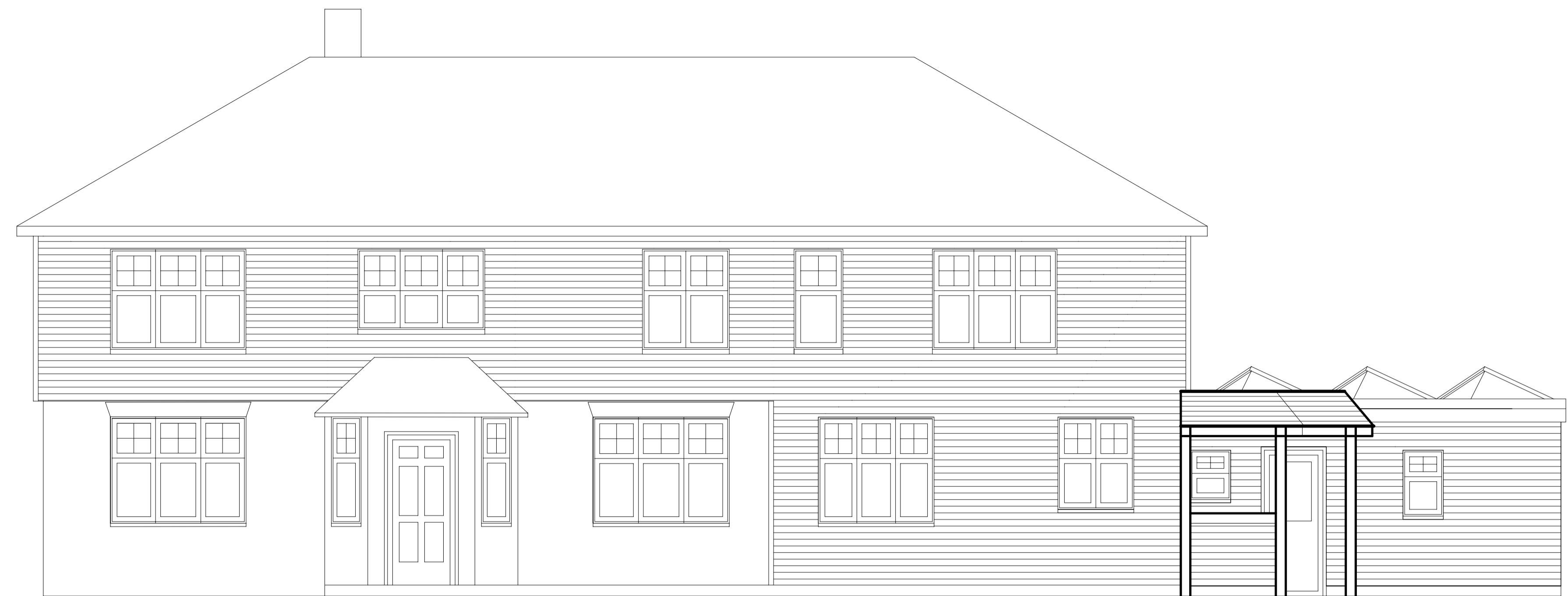
Proposed Front Elevation - Scale 1:50