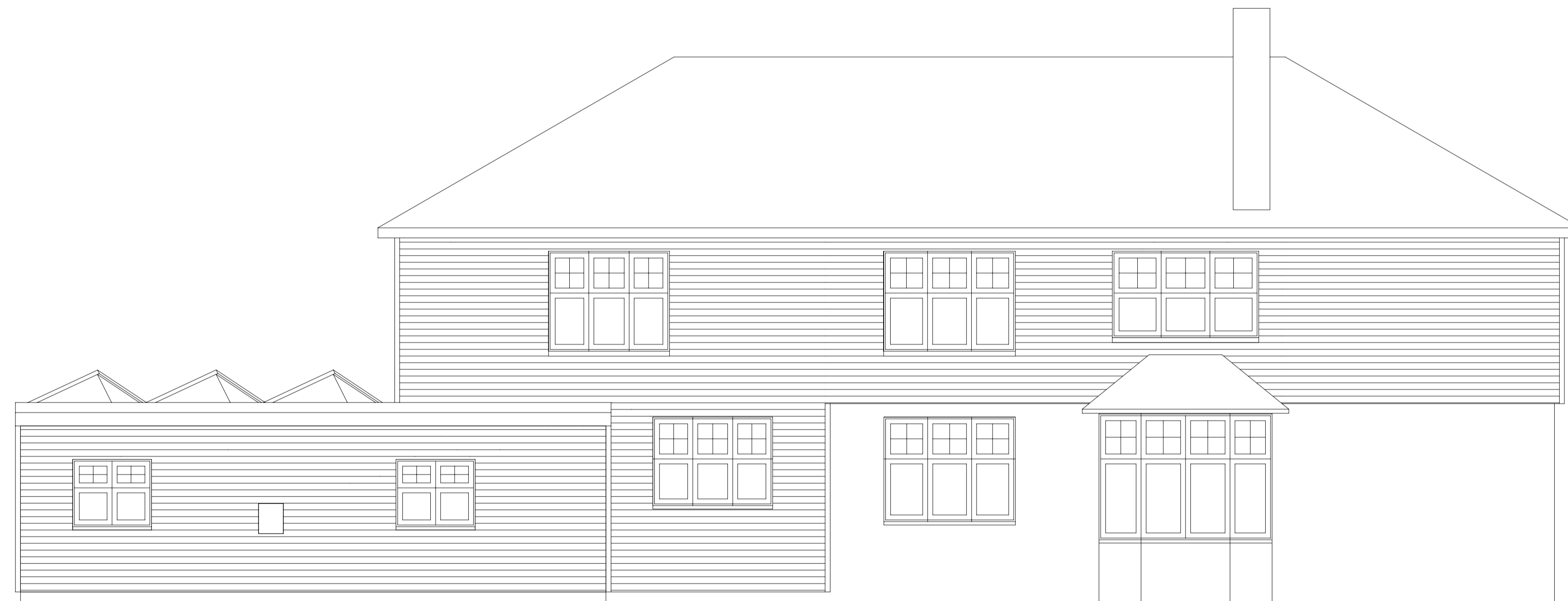
Proposed Rear Elevation - Scale 1:50