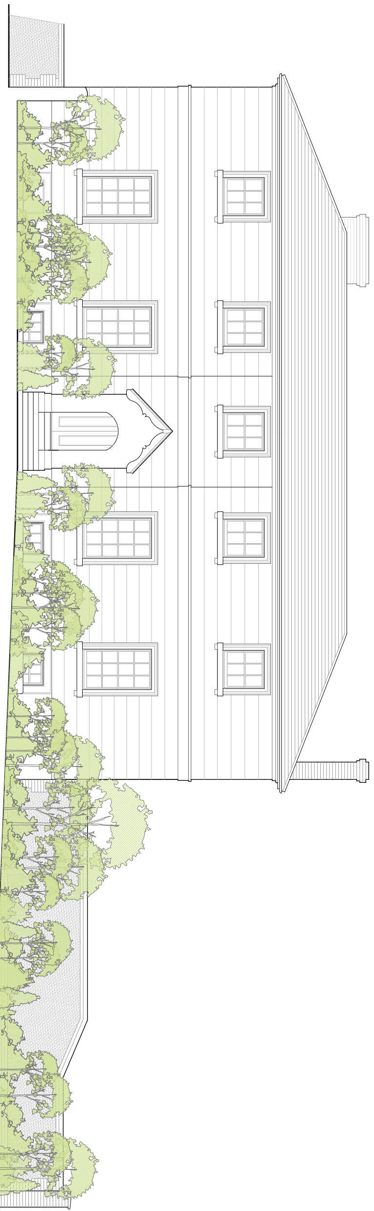
South Elevation: Scale 1:100