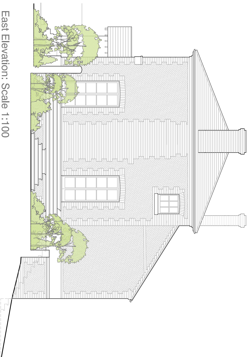
East Elevation: Scale 1:100