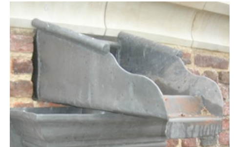
Sample lead catchpit.

To locations A and B on the site plan install a lead catch pit with weir chute to connect the lead box gutter to the existing hopper and downpipe.