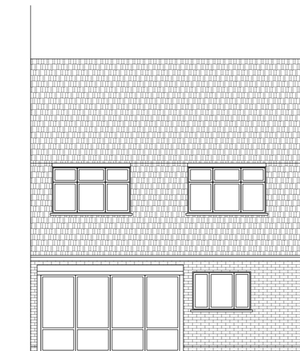
Existing Rear Elevation Scale 1:100