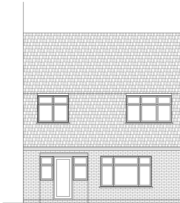
Existing Front Elevation Scale 1:100