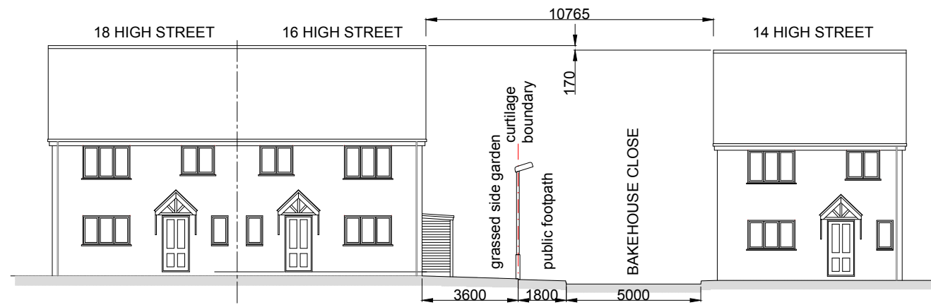
Street View as Existing - from High Street