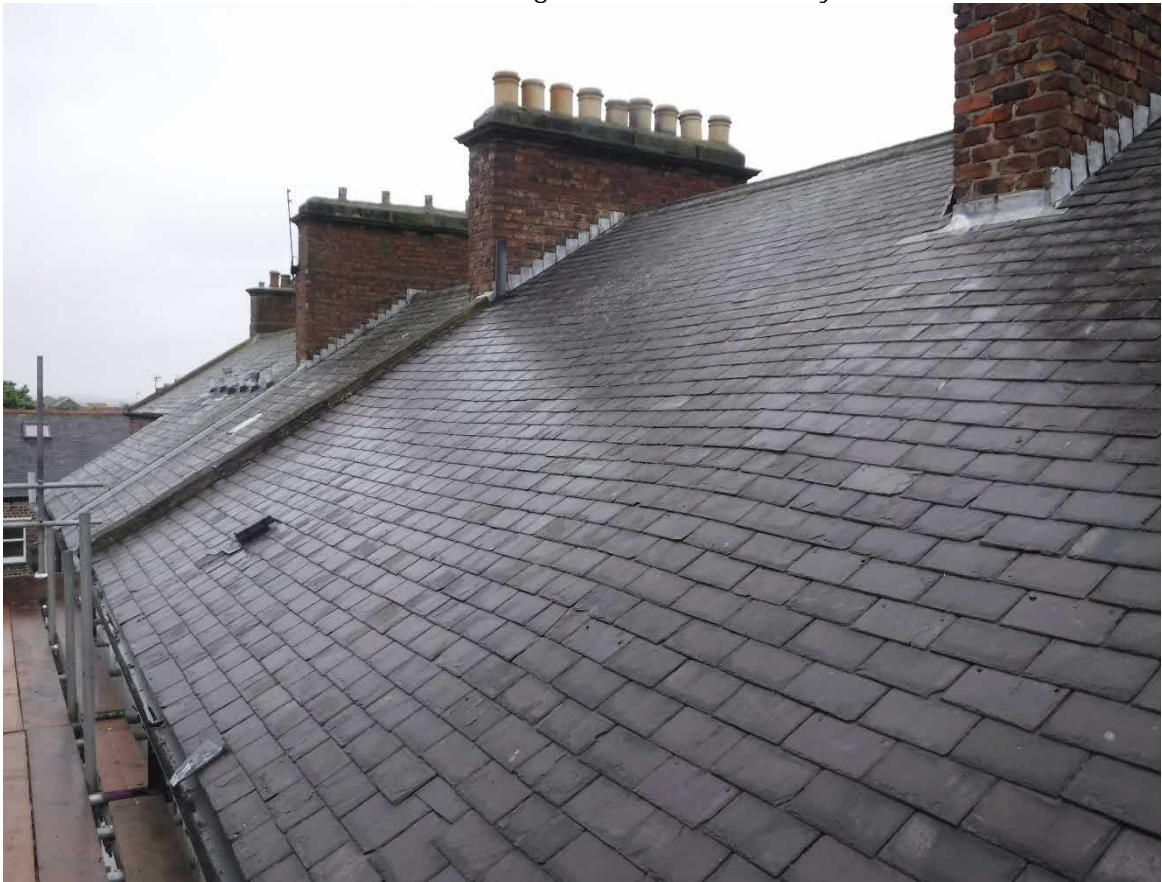
Photo 22 – Rear Elevation – Roof covering between RHS chimney stack and central stack