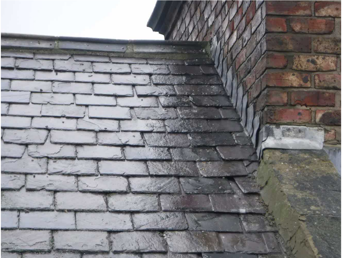
Photo 16 – Front Elevation – Roof covering between central chimney stack and RHS stack