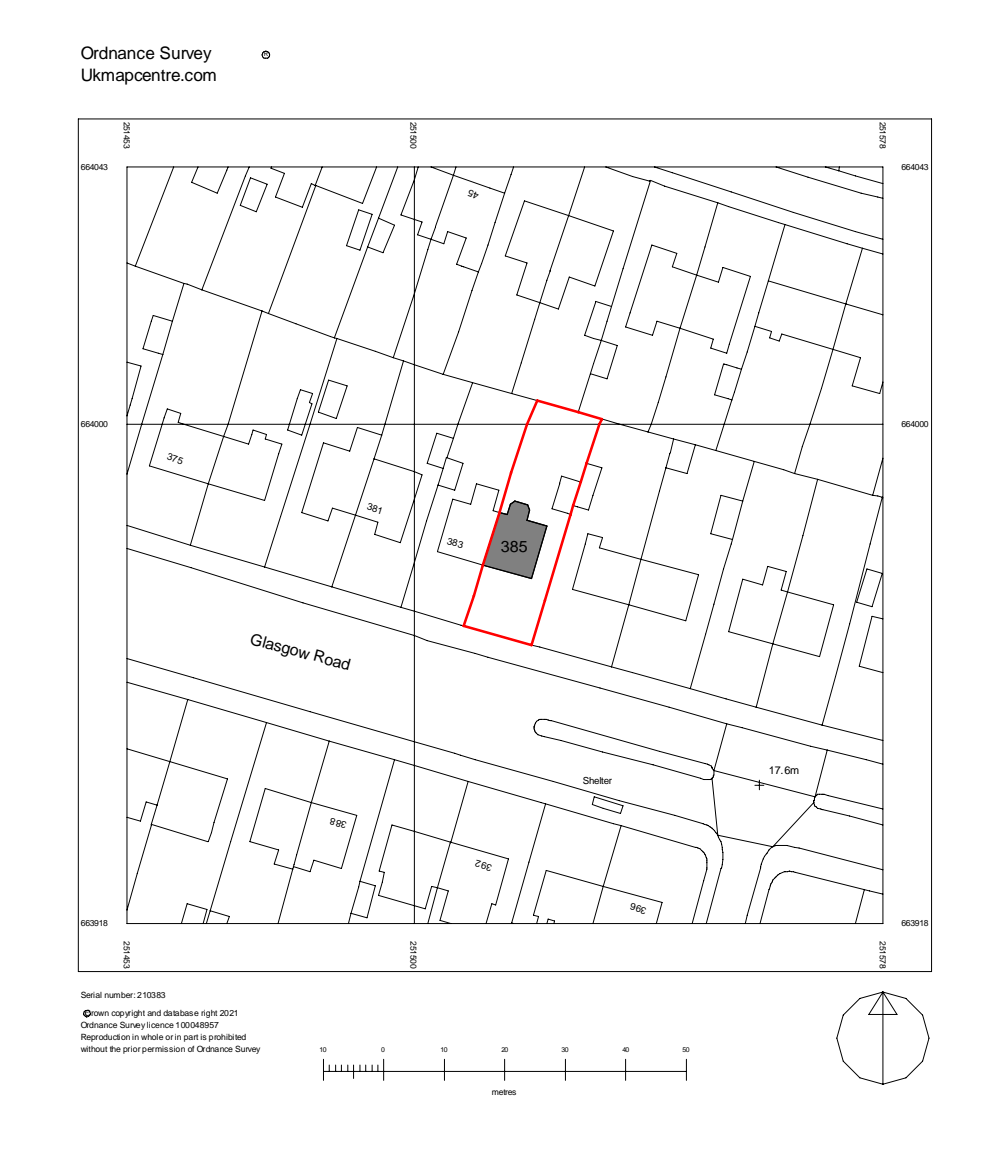
Location Plan 1 : 1250