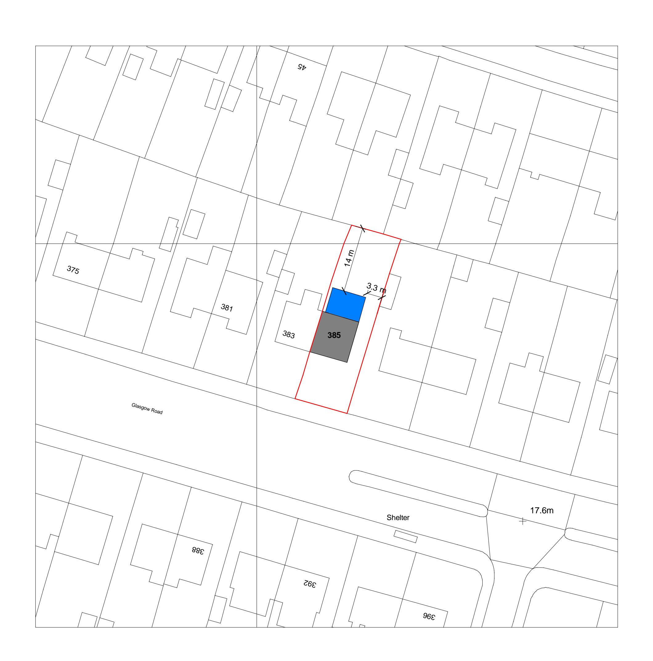
Site Plan - Proposed

We accept no responsibility for the consequences of this document being relied upon by any other party, or being used for any other purpose, or containing any error or omission which is due to an error or omission in data supplied to us by other parties.