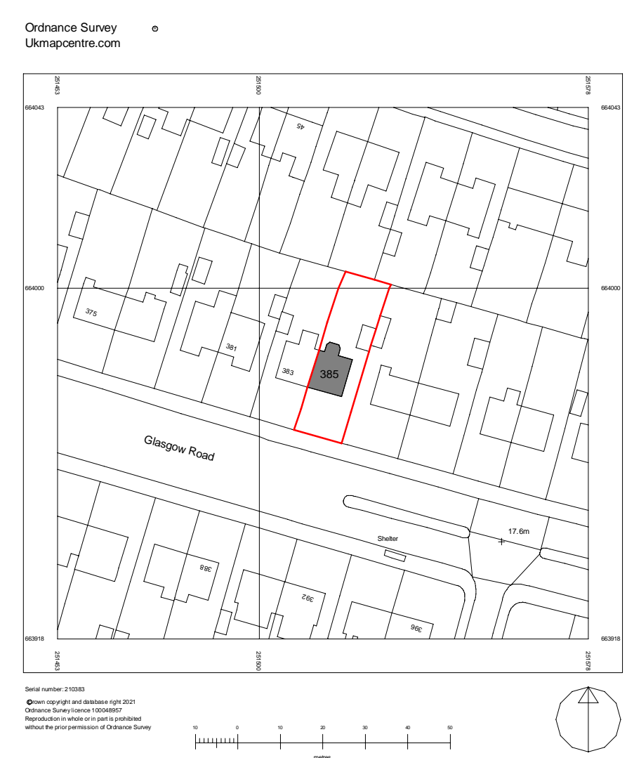
Location Plan 1 : 1250

Key Symbol — Site Boundary - 445 m 2 ■ All proposed works highlighted in BLUE.