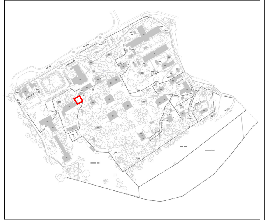
Key Site Plan