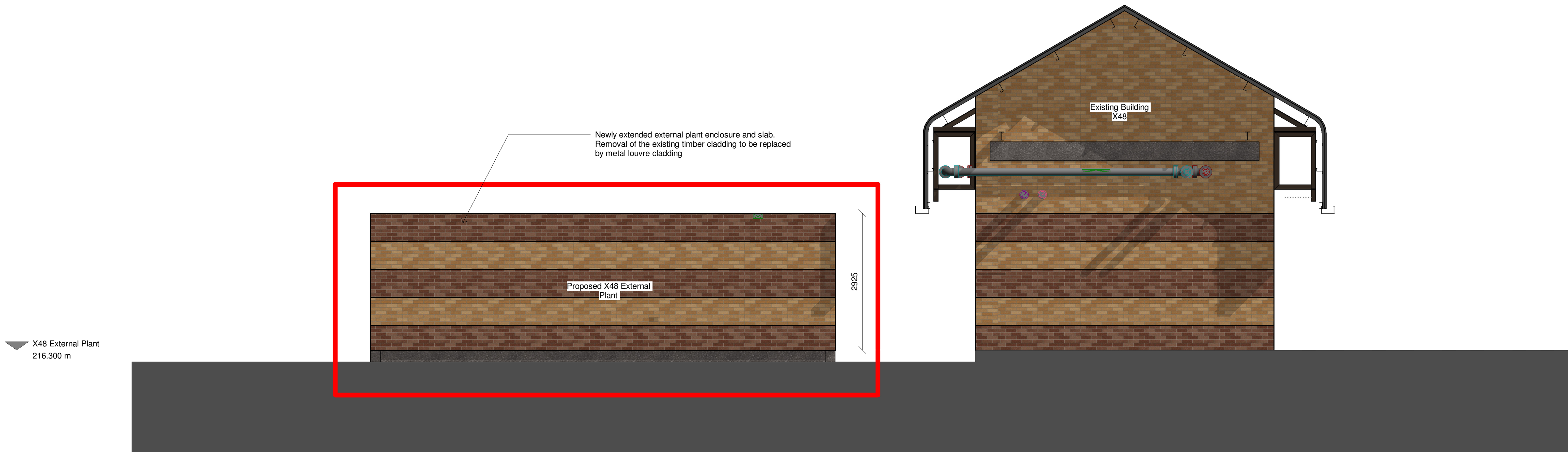
X48 External Plant Elevation 2 Scale: 1 : 50