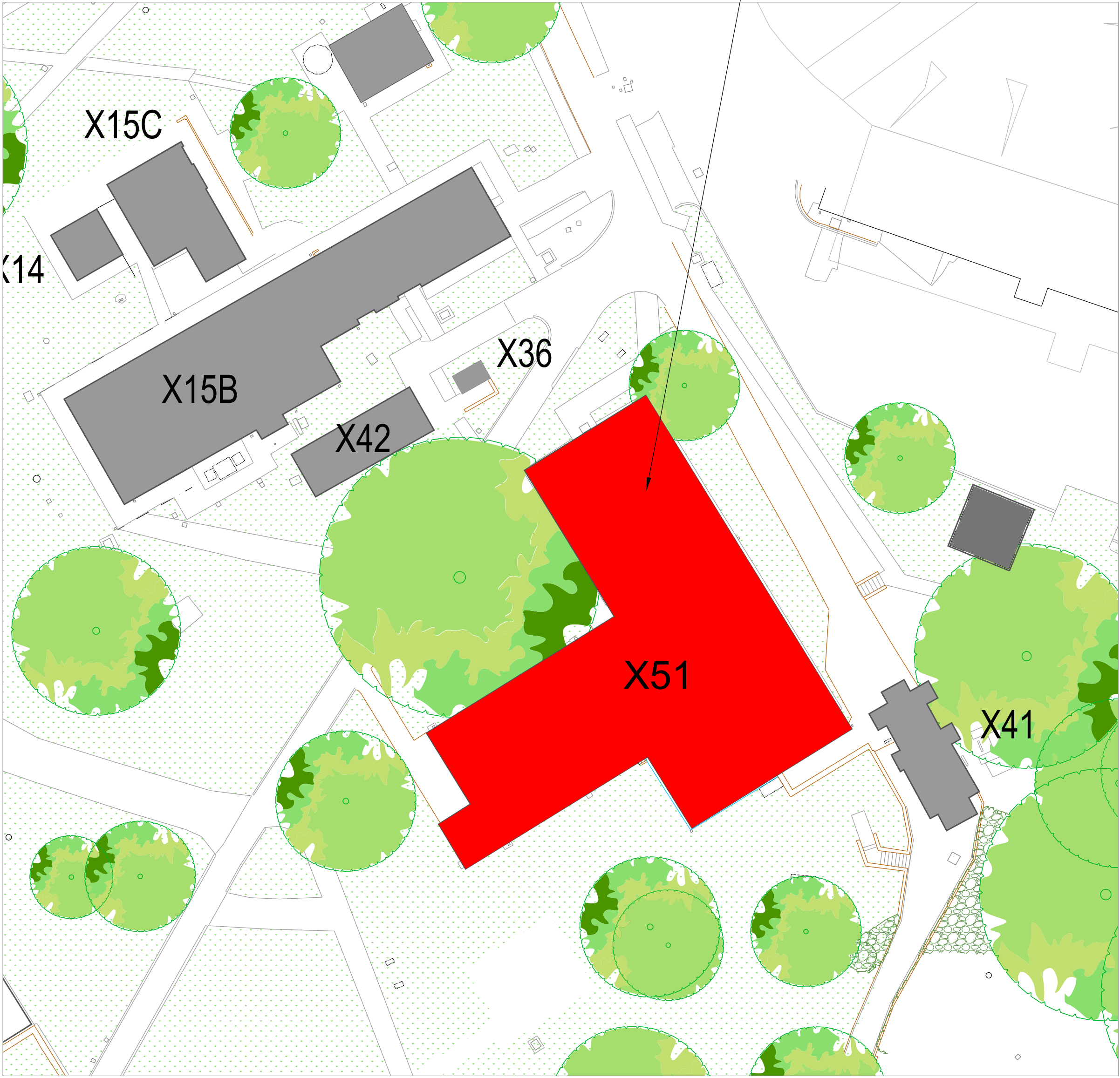
X51 Existing Floor Plan

X51 building to be demolished, leaving the floor slab to act as a base for supporting storage containers