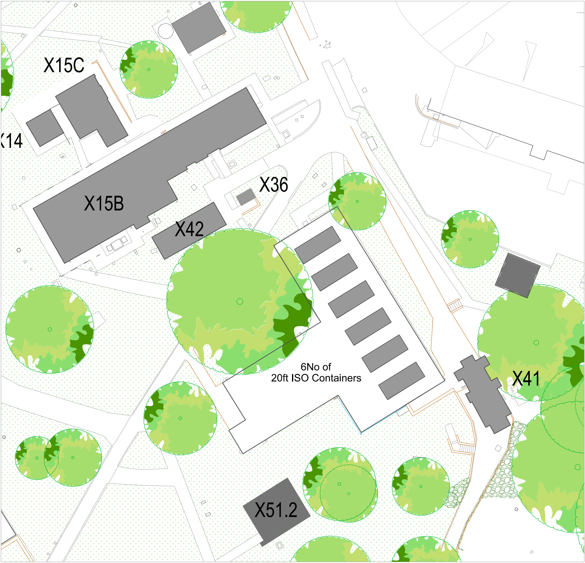
X51 Proposed Floor Plan