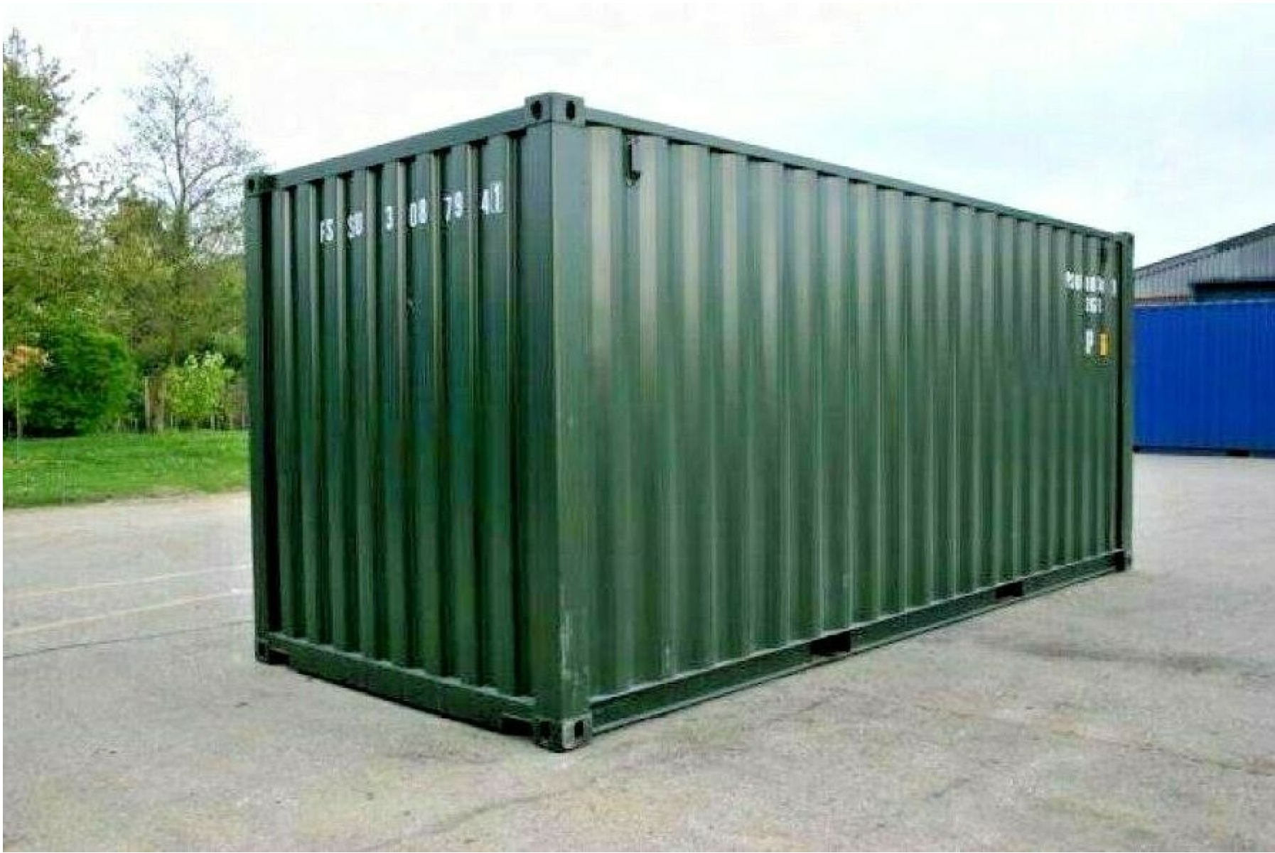
Typical 20ft ISO container proposed for siting on the X51 slab

0 100 This drawing may have been reduced original scale : 100mm