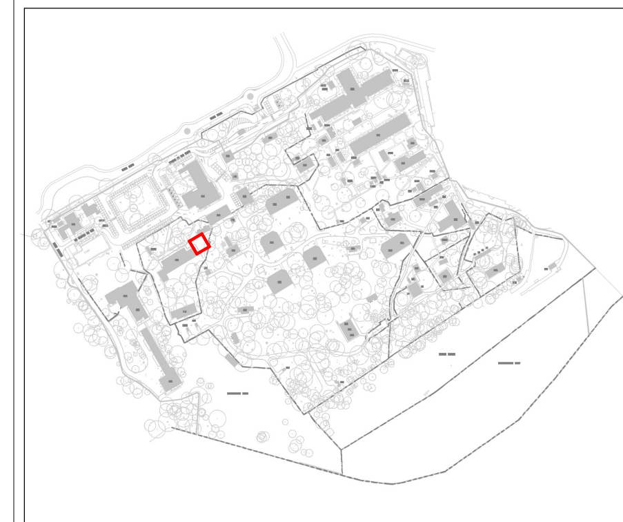
Key Site Plan