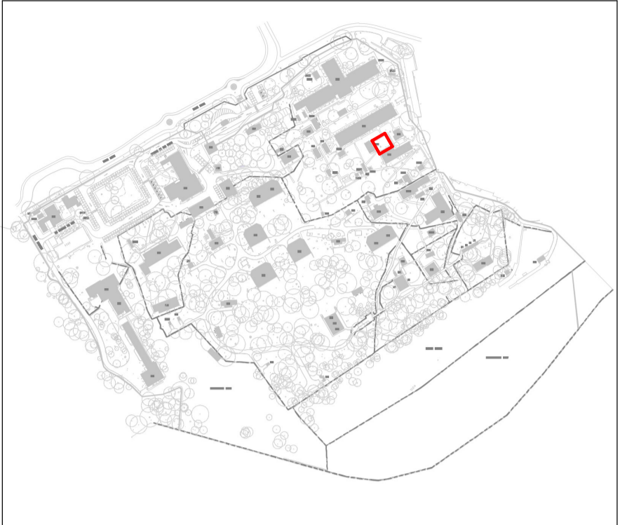
Key Site Plan