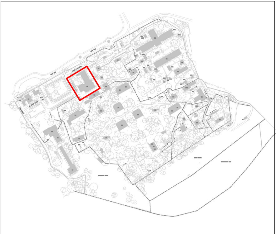
Key Site Plan