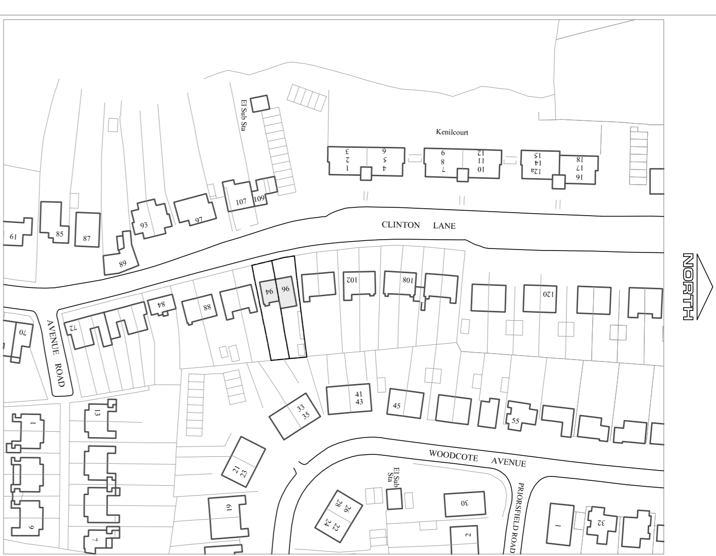
LOCATION PLAN - 1 : 1250