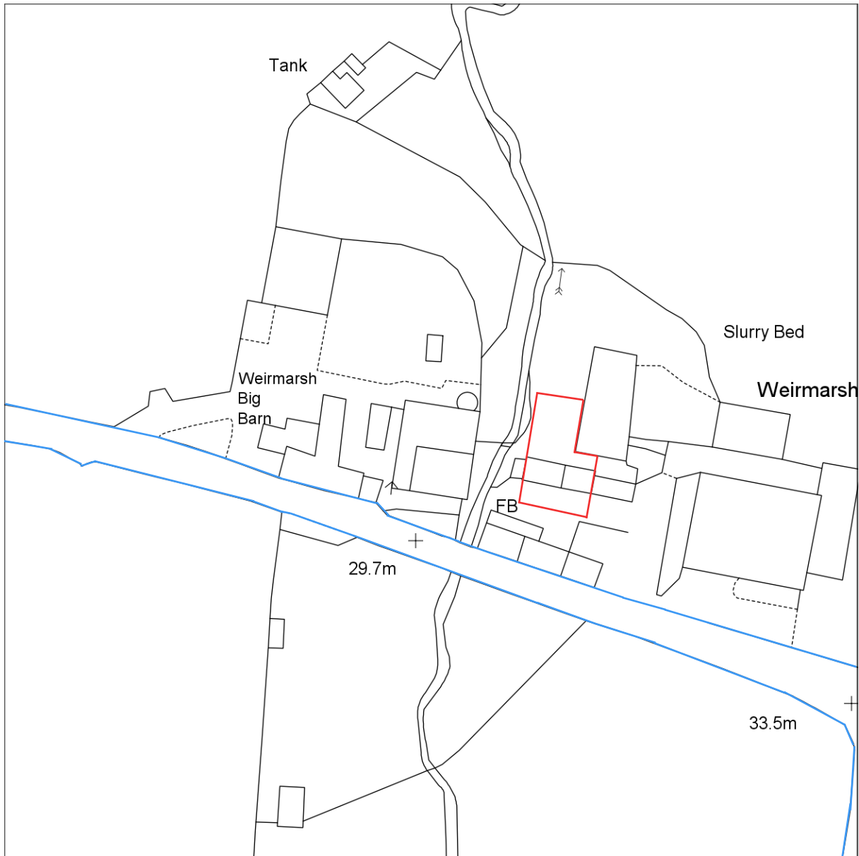
Weirmarsh Farm, High Bickington, Umberleigh