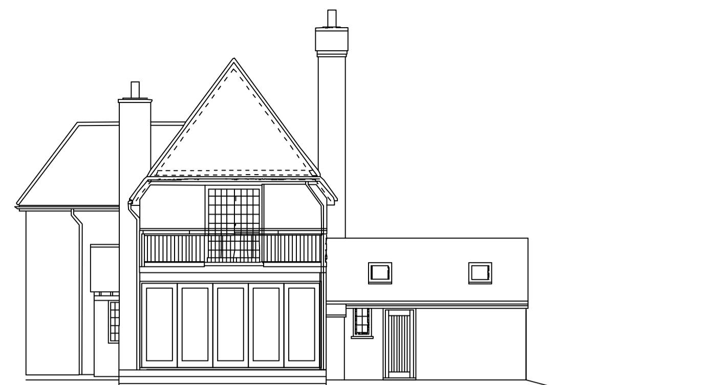
West Elevation Scale 1:100