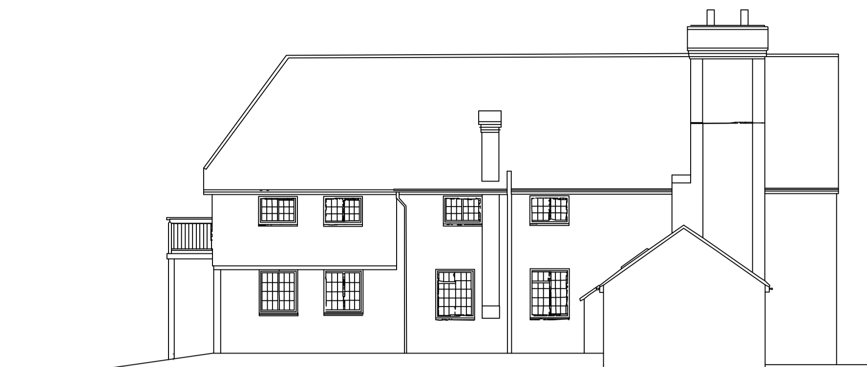
South Elevation Scale 1:100