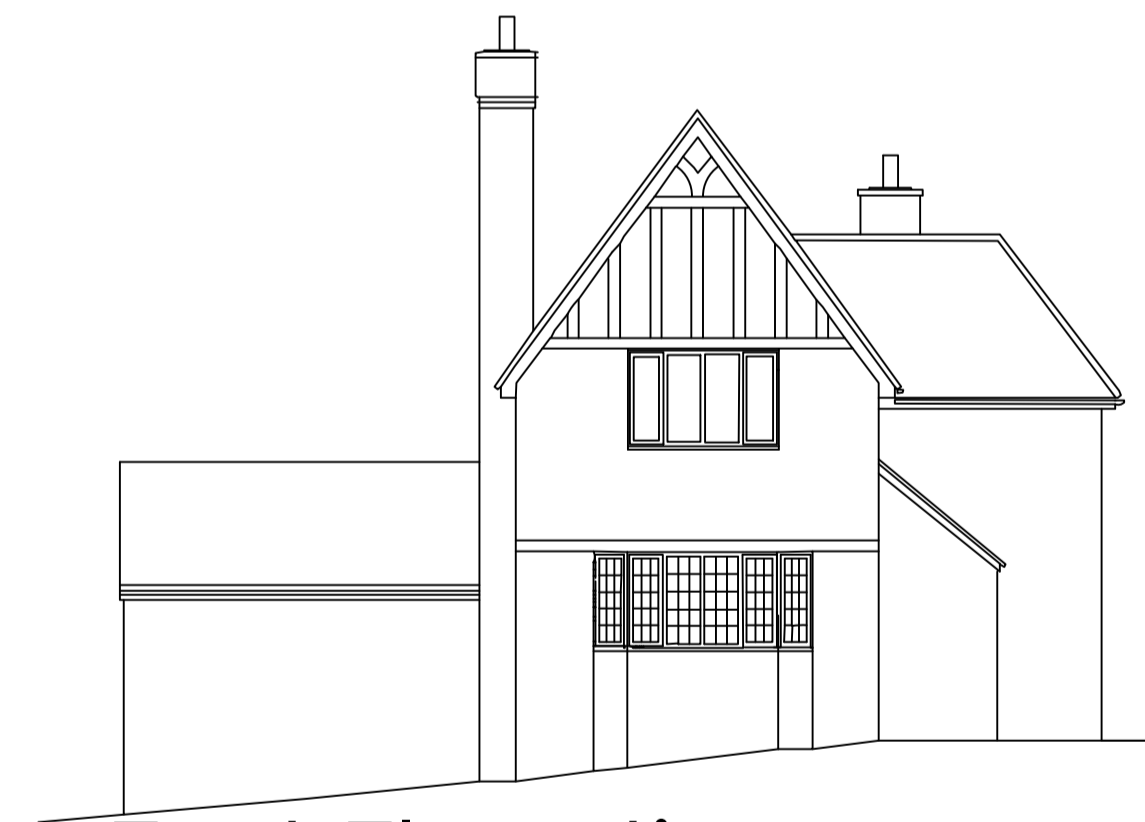
East Elevation Scale 1:100