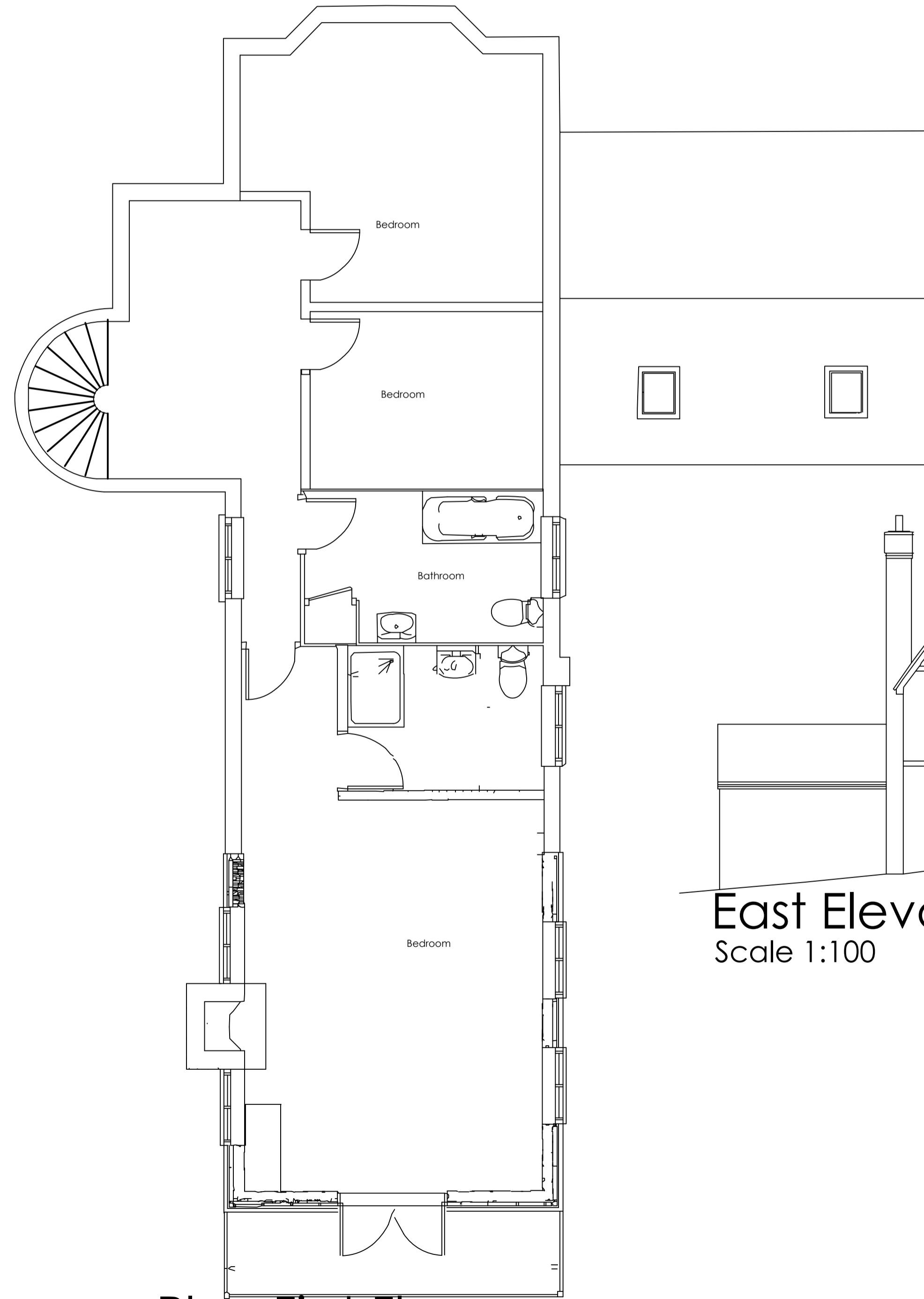
Plan First Floor Scale 1:50