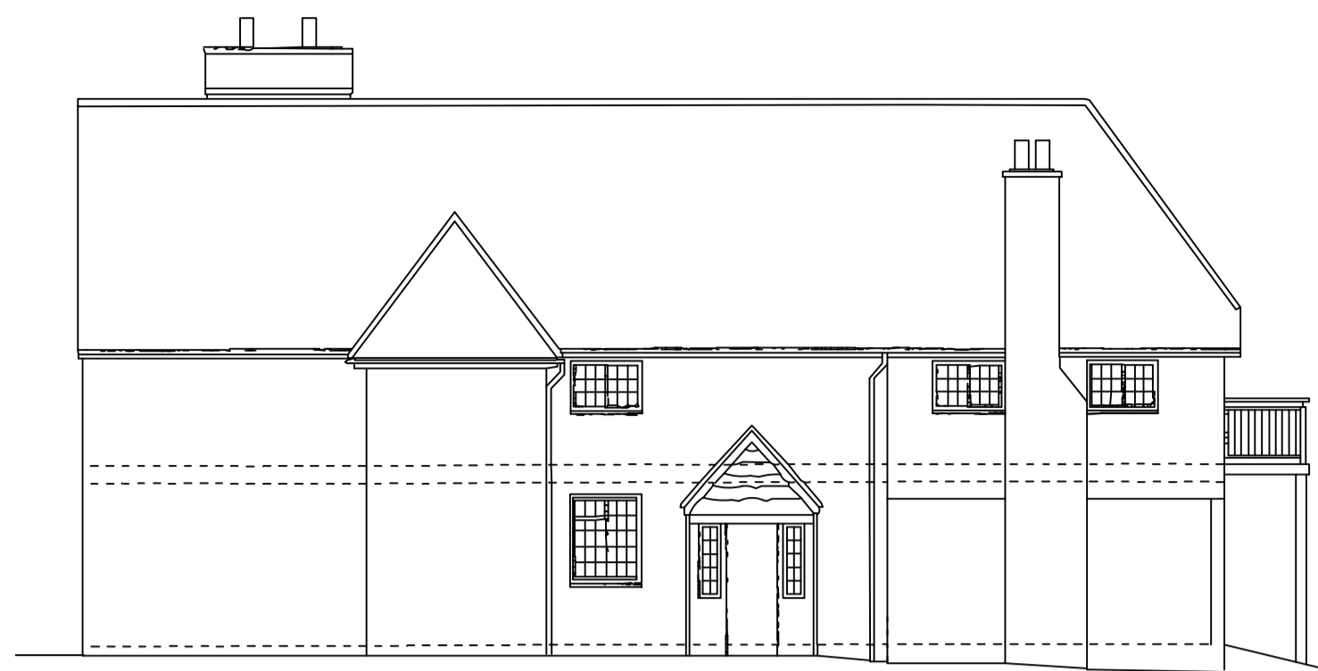
North Elevation Scale 1:100