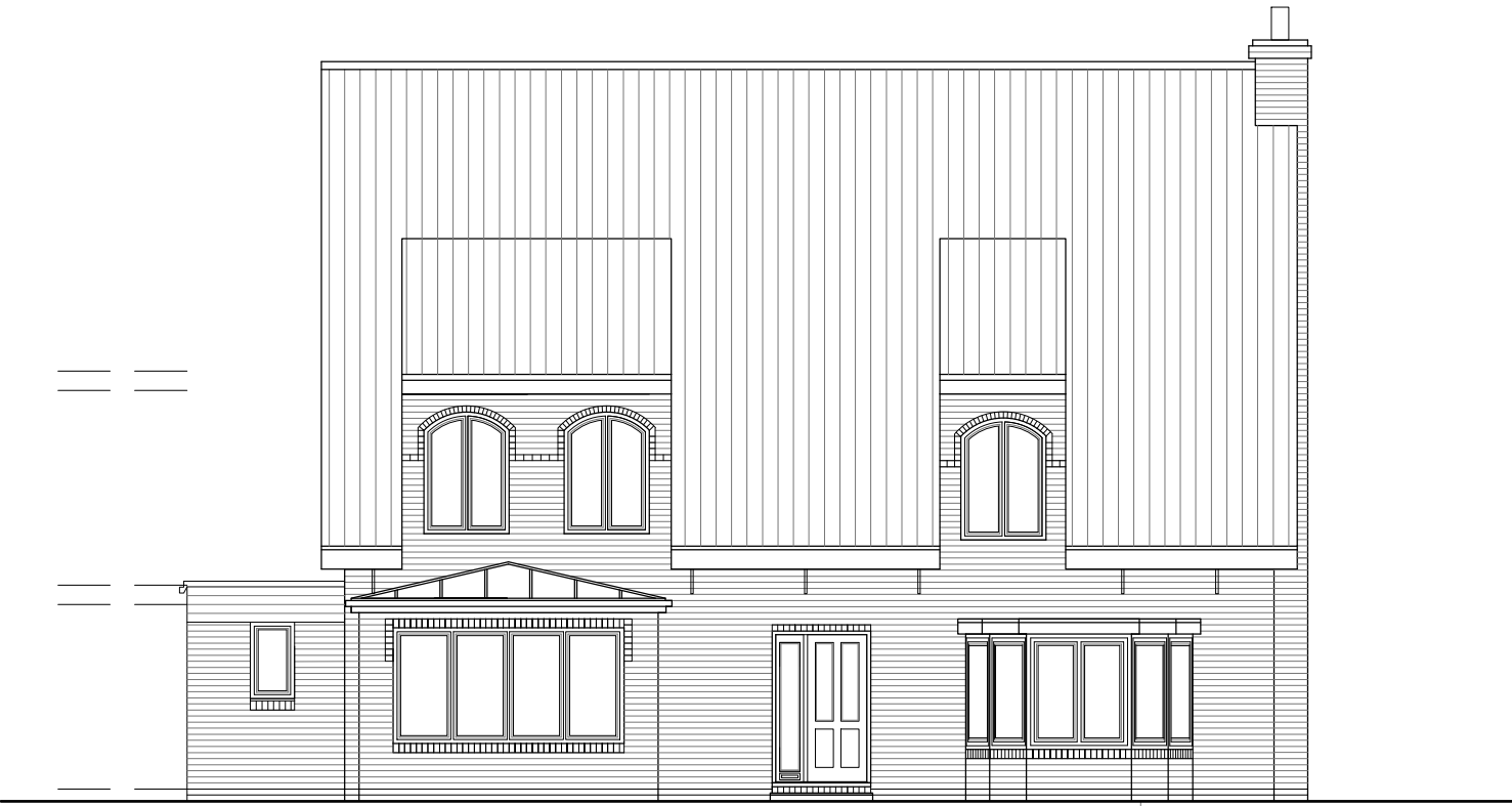
FRONT ELEVATION (NW)