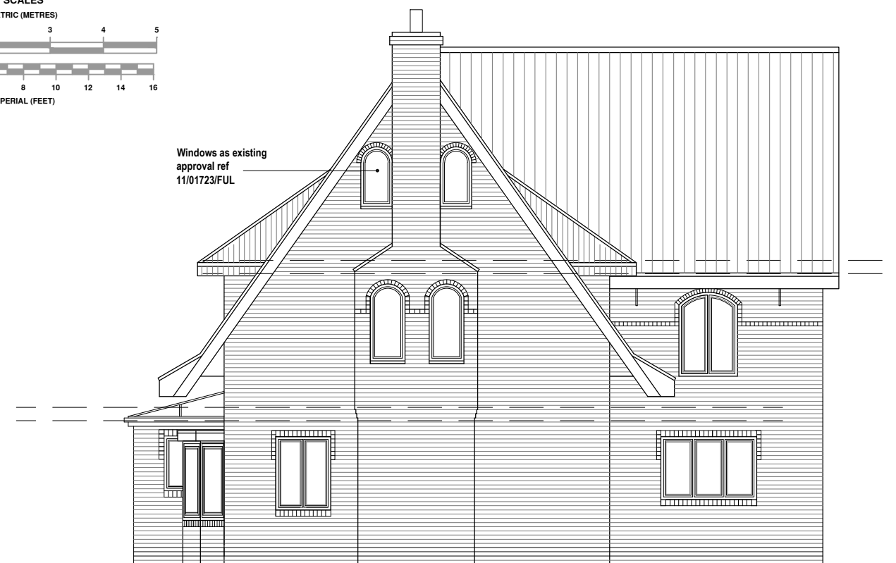
SIDE ELEVATION (SW)