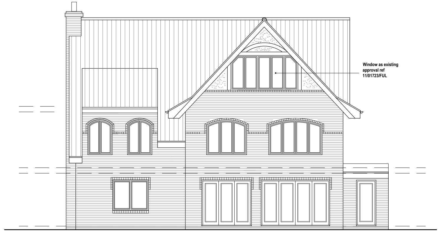
REAR ELEVATION (SE)

THESE DRAWINGS ARE SKETCHES / PLANNING DRAWINGS AND IN NO WAY FORM PART OF THE CONTRACT. SCALE AND/OR DIMENSIONS ARE PROVIDED FOR REFERENCE ONLY AND DO NOT REPRESENT FINISHED ROOM SIZES. DIMENSIONS FOR FIXTURES AND FITTINGS MUST BE MEASURED ON-SITE BY OTHERS PRIOR TO MANUFACTURE/ORDER.