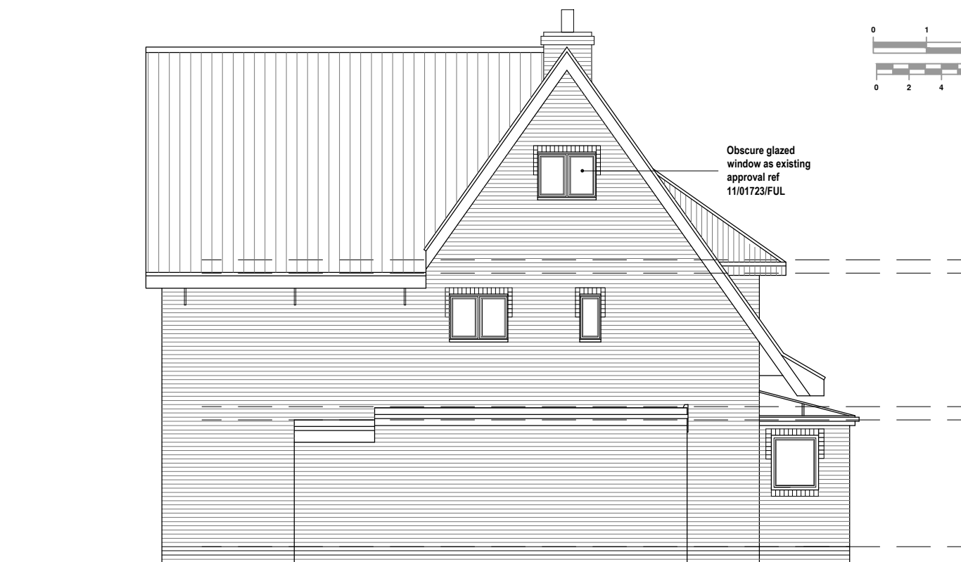
SIDE ELEVATION (NE)