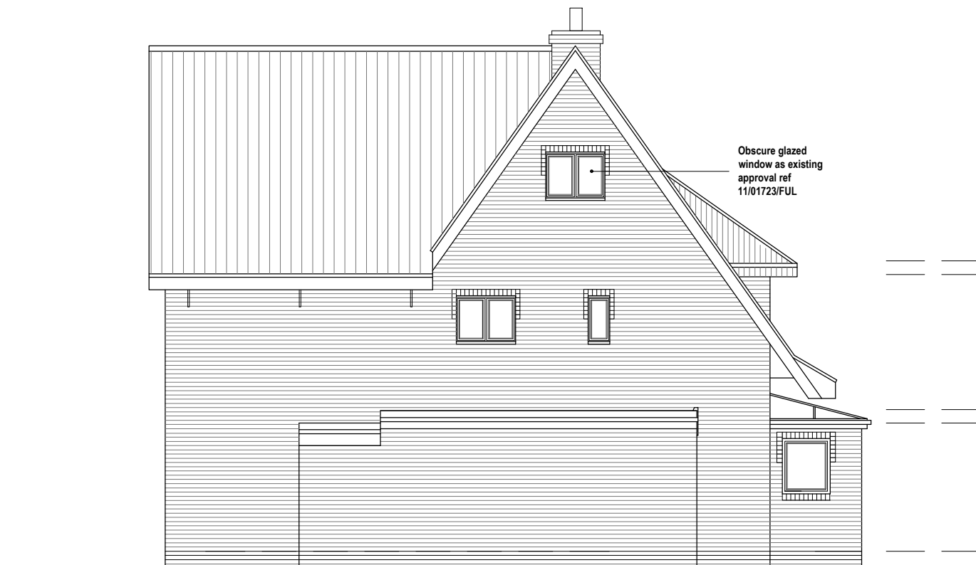
SIDE ELEVATION (NE)