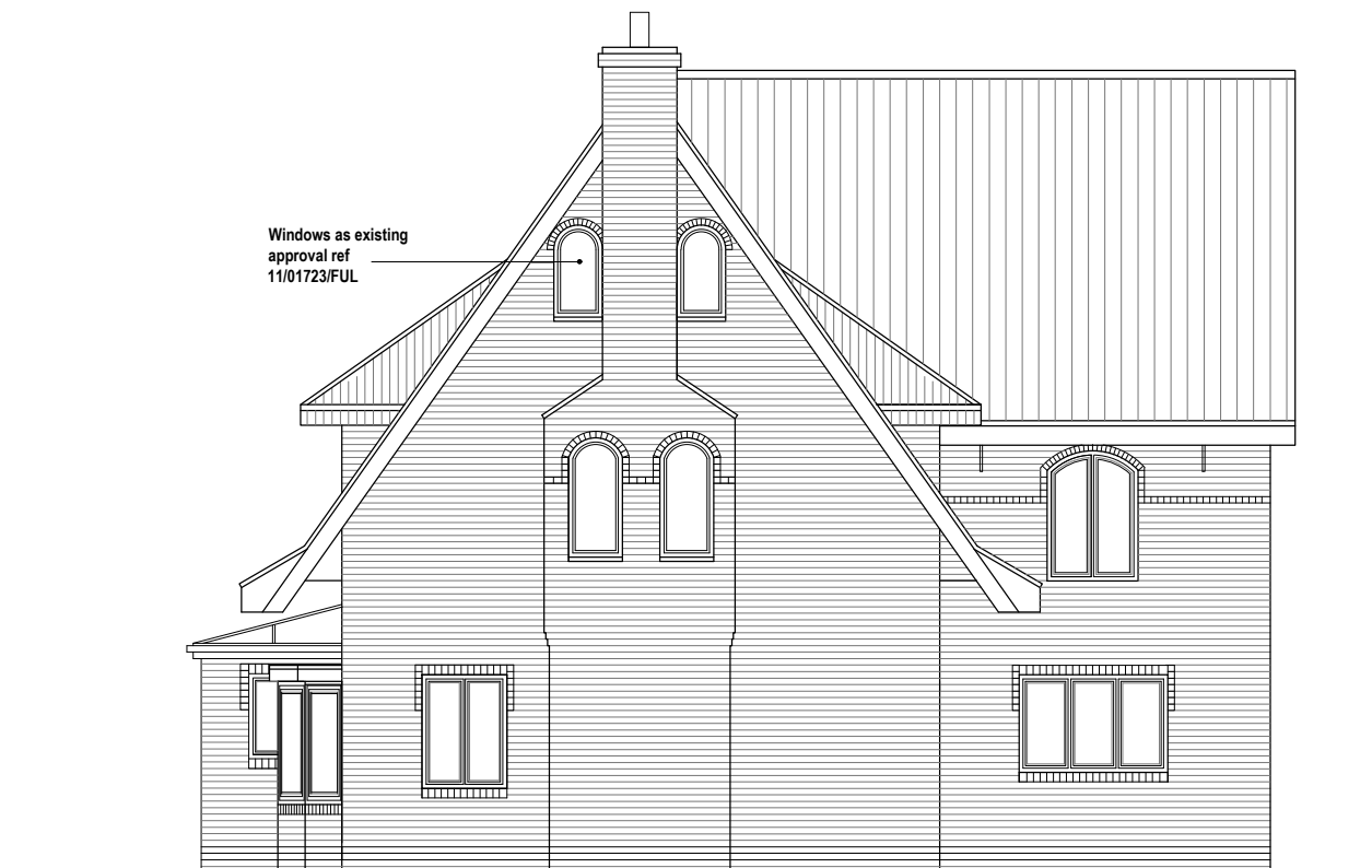
SIDE ELEVATION (SW)

Rev A: 2 No rooflights added to rear elevation. KG 23Jun21