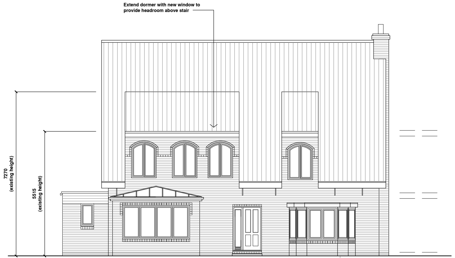
FRONT ELEVATION (NW)

THESE DRAWINGS ARE SKETCHES / PLANNING DRAWINGS AND IN NO WAY FORM PART OF THE CONTRACT. SCALE AND/OR DIMENSIONS ARE PROVIDED FOR REFERENCE ONLY AND DO NOT REPRESENT FINISHED ROOM SIZES. DIMENSIONS FOR FIXTURES AND FITTINGS MUST BE MEASURED ON-SITE BY OTHERS PRIOR TO MANUFACTURE ORDER.