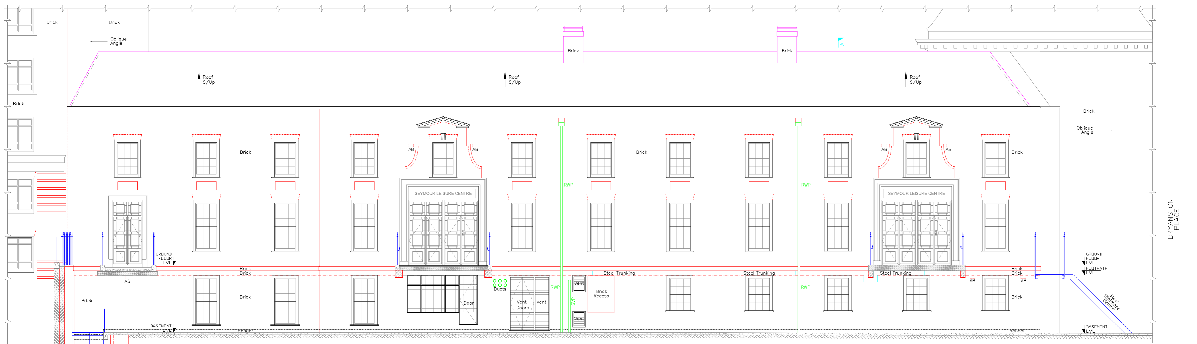
ELEVATION B-B AS EXISTING (SCALE 1:100(A2); 1:200(A4))

GENERAL NOTES DO NOT SCALE THIS DRAWING. USE FIGURED DIMENSIONS ONLY. ANY ERRORS OR OMISSIONS ARE TO BE REPORTED TO THE ENGINEER IMMEDIATELY. ALL DIMENSIONS ARE IN MILLIMETERS UNLESS NOTED OTHERWISE. THIS DRAWING IS TO BE READ IN CONJUNCTION WITH ALL RELEVANT ENGINEERS DRAWINGS, SPECIFICATIONS AND SCHEDULE OF WORKS. TM=TELECOM MANHOLE; CB=CONTROL BOX; MH=MANHOLE; D=DUCT; RWP=RAIN WATER PIPE; SWP=SOIL VENT PIPE; SV=SLUICE VALVE; RS=ROAD SIGN; LP=LAMP POST; ER=EARTHING ROD;