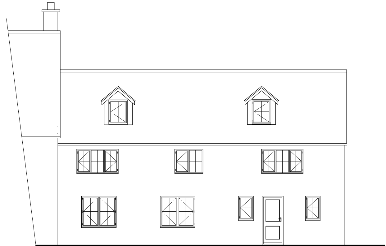
SOUTH ELEVATION PROPOSED 1:100