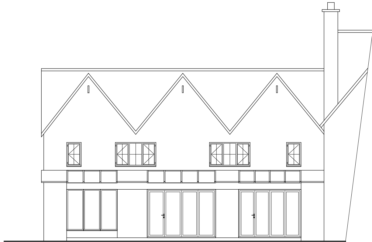
NORTH ELEVATION PROPOSED 1:100