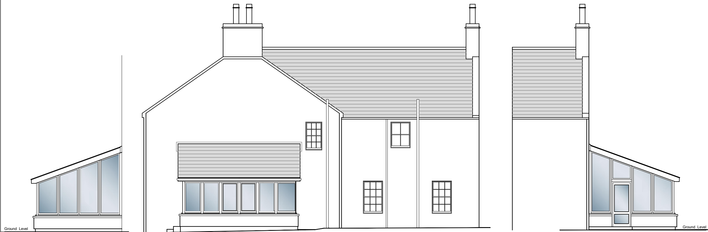
Elevation to Rear Elevation to Side Elevation to Front