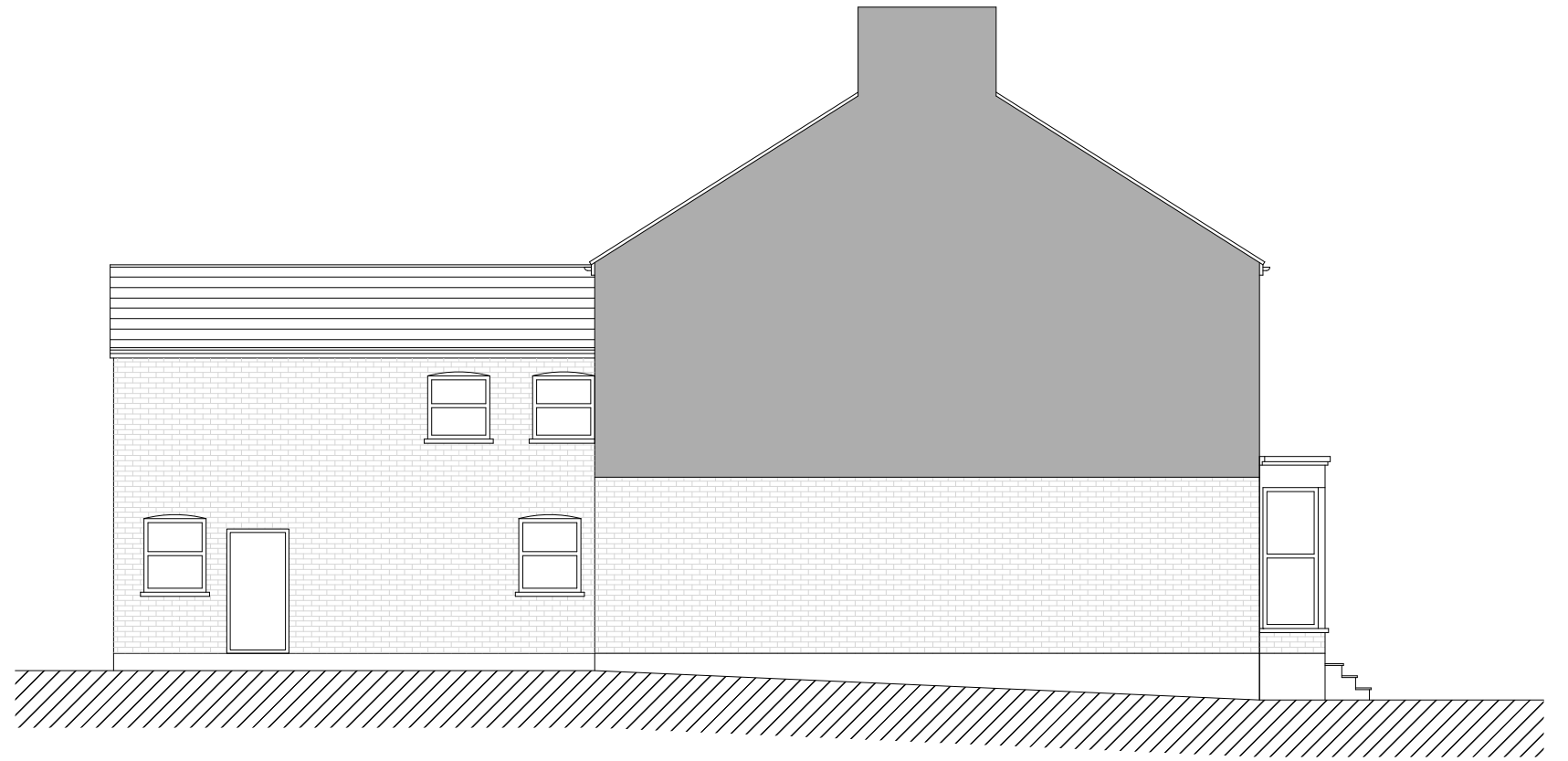
Side Sectional Elevation